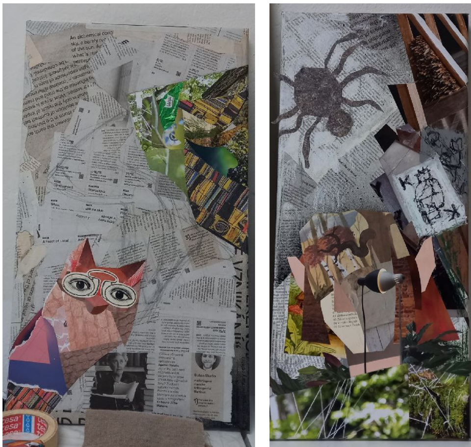
Fig. 2,3. Process of the central collaged canvases