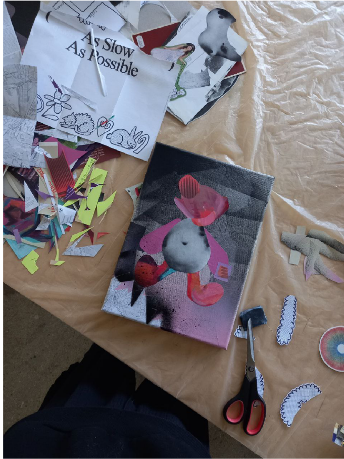
Fig. 4. Process of the collaged canvas