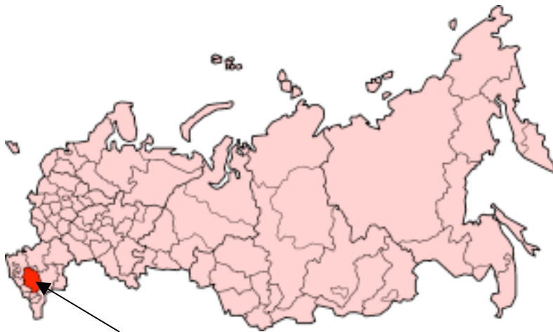
Figure 5.1 – Map of Russian Federation (Stavropol Kraj)