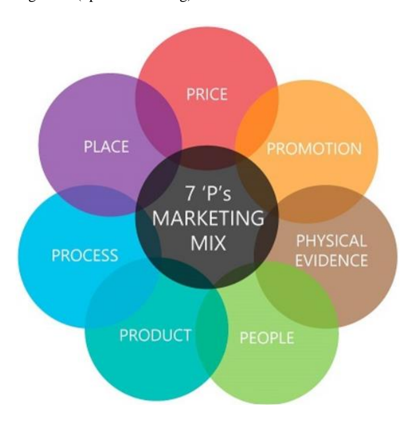
Figure: 2 (7ps of marketing)