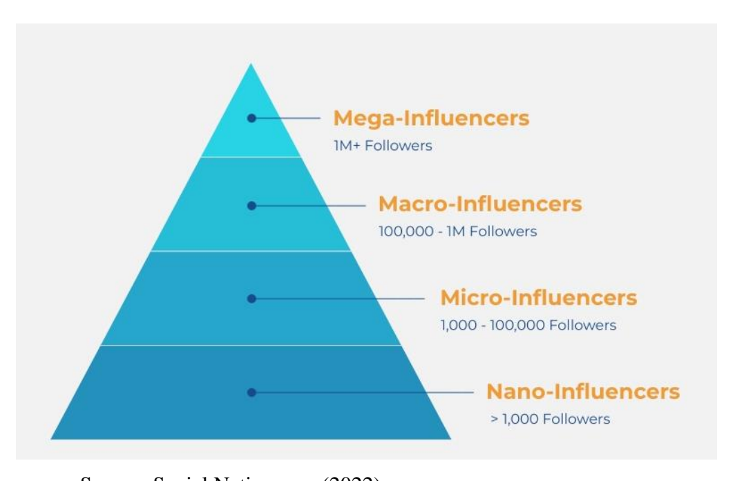
Figure:1 (Types of Influencers)

With extensive followings ranging from millions to tens of millions on multiple platforms, they exert significant sway over their audience and engage in collaborations with brands for endorsement deals and sponsored content (Business Insider,2021). On the other hand, macroinfluencers, characterized by significant followings ranging from tens of thousands to millions, are recognized as experts or authorities in specific niches. They partner with brands to promote products or services, leveraging their expertise and reach (Influencer Marketing Hub,2022). Micro-influencers, with smaller yet highly engaged followings typically between 1,000 to 100,000 followers, are renowned for their authenticity and niche expertise. Brands often collaborate with micro-influencers for targeted and cost-effective marketing campaigns. Lastly, nano-influencers, with small yet deeply loyal followings comprised of friends, family, and local community members, play a vital role in grassroots marketing and word-of-mouth promotion. They are valued for their authenticity and relatability, often collaborating with brands on localized campaigns and product launches. The types can be seen in figure 1 below