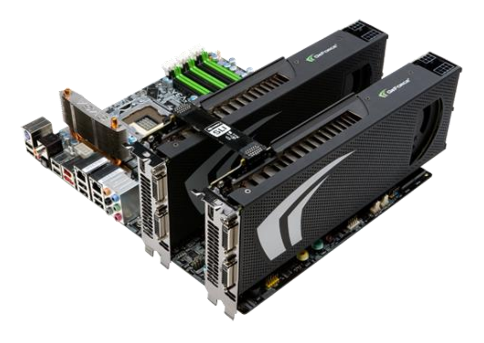
Figure 1 - Two graphics cards from Nvidia connected via SLI.

NVIDIA motherboard partners offer nForce SLI motherboards for both AMD and Intel CPUs. [13]