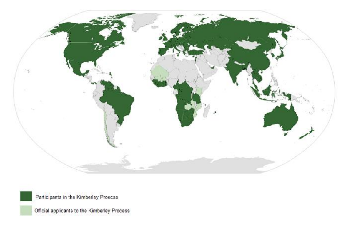
Image 2: Map of participants and applicants of the Kimberley Process

Currently, the KP has 54 members representing 81 countries, including the European community and its member states which act as a single unit. The participating states represent more than 95% of the world extraction of diamonds and almost 100% of the legal trade with them. Rules and regulations adopted by the organization include disciplinary measures, mainly the obligation of the organization to exclude any member whom the ordinary investigating procedure finds a serious infringement of the principles of the KPCS.<sup>24</sup>