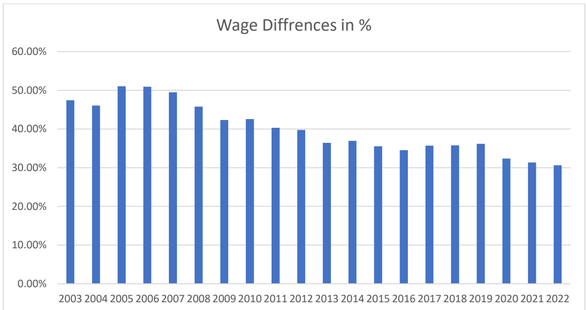
Figure 2: Gender Wage differences in %, in Georgia (2003-2022)

Source: Author's computation based on data from the National Statistics Office of Georgia, (2003-2022)