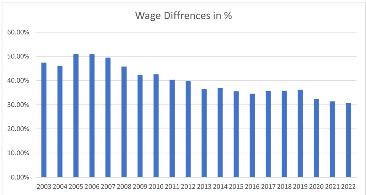
Figure 2: Gender Wage differences in %, in Georgia (2003-2022)

Source: Author's computation based on data from the National Statistics Office of Georgia, (2003-2022)