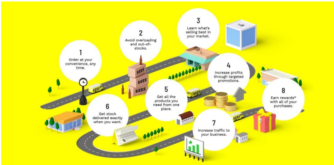
Figure 2:: Process of Order