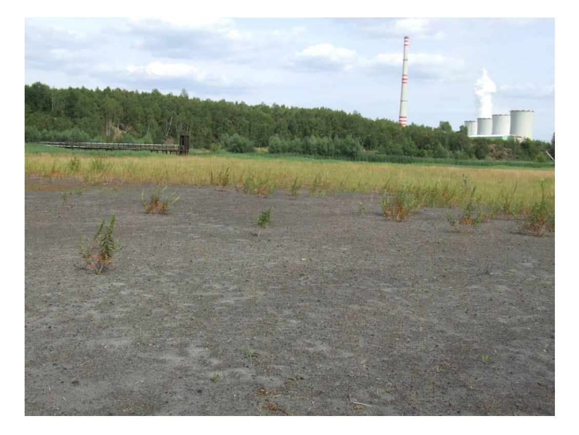
Fig. 2: An example of ash-slag deposit in this case Přelouč – Chvaletice