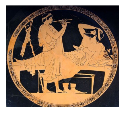
Figure 4, A vase painting in ancient Greece depicting two young men

To begin, people need to understand this concept, and LGBT is just an acronym that helps to refer to persons who are lesbian, gay, bisexual, and transgender. It is vital to take a step back and discuss the movement's true beginning in order to adequately prepare for portraying the history of LGBT people and the cause that is particularly present. Relationships between men who identified as gay were likewise not understood without ambiguity in ancient times, although this did not result in hatred. For instance, in the societies of southern Africa, the practice of cohabitation between younger males and older men was common. In Egypt, the act of two males engaging in sexual activity was even painted on paintings. Homosexual partnerships were commonplace among the indigenous people of North America and India, as well as among the emperors of China and Japan. Additionally, this phenomenon was ingrained in the culture and religion of India.