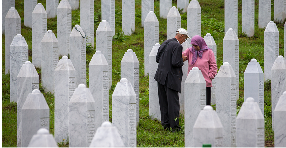
Figure 2, Memorial to the victims of the genocide in Srebrenica

As an example, one of the types of discrimination and its consequences are the genocides of entire nations and entail a huge number of terrible events. Genocides, ethnic cleansing, and forced segregation are all potential outcomes of racism and prejudice based on ethnicity. In 1995, the city of Srebrenica in Serbia was the site of a genocide that took place when Serbian soldiers murdered around 8,000 Bosnian Muslims in the span of only a few days (Zveržhanovski, 2007).