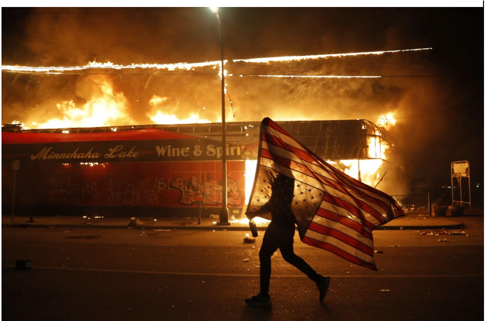
Figure 3, Protests in USA after George Floyd death

At the same time, it is impossible to ignore the fact that discrimination can be a component of a larger issue. Take, for instance, the situation with the repercussions of the death of George Floyd, which led to widespread demonstrations and resulted in the destruction of many streets and almost all of the shops in America, but the individuals who committed these crimes justified their actions by claiming that they themselves were winning their rights through the destruction of the shops. Since it is still unclear what the Black Lives Matter movement was all about, the problem of racism and attitudes towards African Americans in the United States has a significant and widespread impact on culture. Because after the events of 2020, when George was assassinated, virtually the entire world backed this campaign and tried to show that regardless of what nationality, people need to cherish the lives of people of various races, life principles, and religions. The ferocity and length of the demonstrations were clear indications that the issues at hand extended to a much deeper level than the lynching of a Black man in Minneapolis.