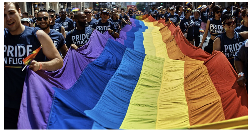
Figure 6, LGBT Pride Month Movement

There are more than a hundred LGBT organizations around the world. Some work on the territory of the whole country, others operate within individual companies. For example, Google and Microsoft have communities dedicated to supporting homosexual employees.