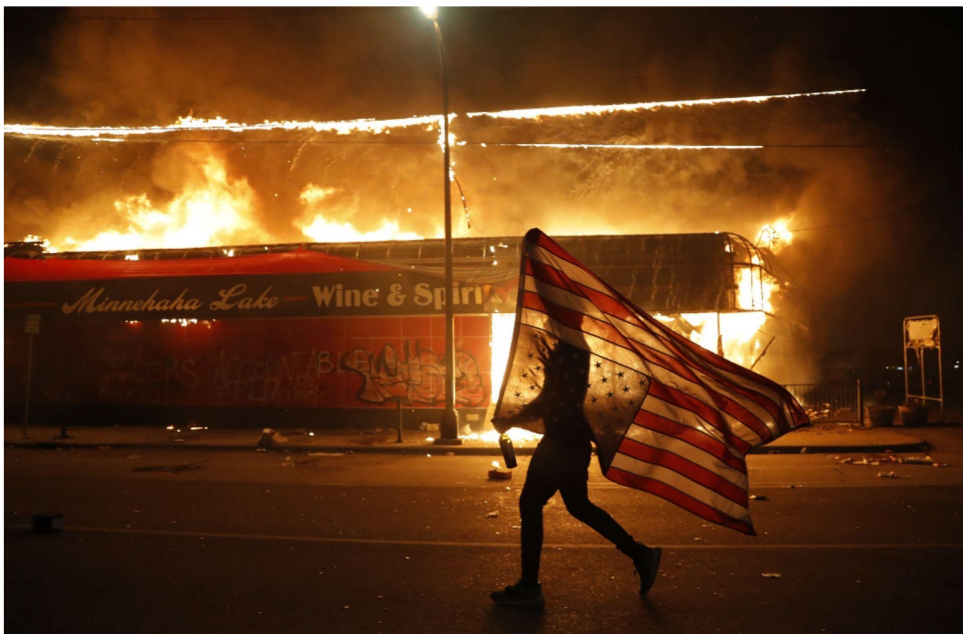
Figure 3, Protests in USA after George Floyd death

At the same time, it is impossible to ignore the fact that discrimination can be a component of a larger issue. Take, for instance, the situation with the repercussions of the death of George Floyd, which led to widespread demonstrations and resulted in the destruction of many streets and almost all of the shops in America, but the individuals who committed these crimes justified their actions by claiming that they themselves were winning their rights through the destruction of the shops. Since it is still unclear what the Black Lives Matter movement was all about, the problem of racism and attitudes towards African Americans in the United States has a significant and widespread impact on culture. Because after the events of 2020, when George was assassinated, virtually the entire world backed this campaign and tried to show that regardless of what nationality, people need to cherish the lives of people of various races, life principles, and religions. The ferocity and length of the demonstrations were clear indications that the issues at hand extended to a much deeper level than the lynching of a Black man in Minneapolis.