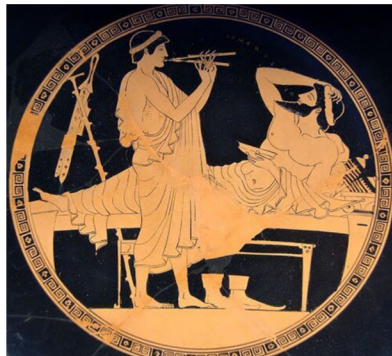
Figure 4, A vase painting in ancient Greece depicting two young men

To begin, people need to understand this concept, and LGBT is just an acronym that helps to refer to persons who are lesbian, gay, bisexual, and transgender. It is vital to take a step back and discuss the movement's true beginning in order to adequately prepare for portraying the history of LGBT people and the cause that is particularly present. Relationships between men who identified as gay were likewise not understood without ambiguity in ancient times, although this did not result in hatred. For instance, in the societies of southern Africa, the practice of cohabitation between younger males and older men was common. In Egypt, the act of two males engaging in sexual activity was even painted on paintings. Homosexual partnerships were commonplace among the indigenous people of North America and India, as well as among the emperors of China and Japan. Additionally, this phenomenon was ingrained in the culture and religion of India.