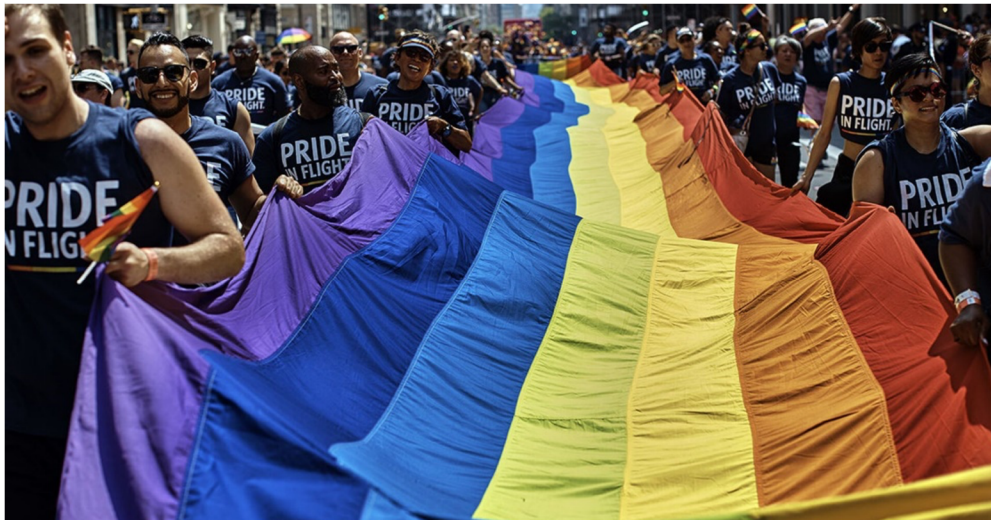
Figure 6, LGBT Pride Month Movement

There are more than a hundred LGBT organizations around the world. Some work on the territory of the whole country, others operate within individual companies. For example, Google and Microsoft have communities dedicated to supporting homosexual employees.