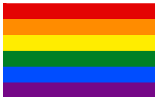
Figure 5, LGBT Official Flag

Since then, the flag has evolved into a symbol of the fight for equality that is waged by sexual minorities. Originally, there were eight different hues represented on the movement's banner. The color pink represented sexuality, the color red represented life, the color orange represented health, the color yellow represented sunlight, the color green represented nature, the color turquoise represented magic, the color indigo represented calmness, and the color purple represented mental fortitude. However, in the end, they chose to keep only six colors, getting rid of pink and turquoise in the process.