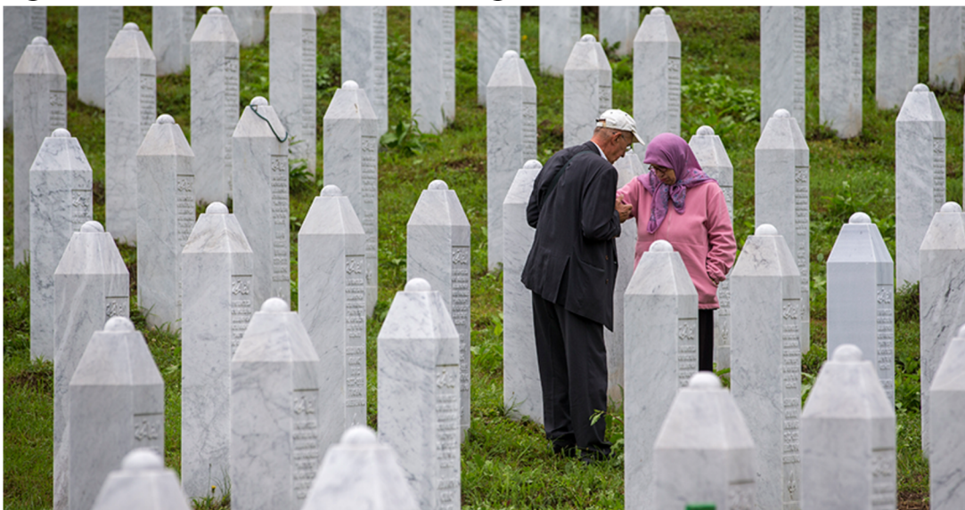
Figure 2, Memorial to the victims of the genocide in Srebrenica