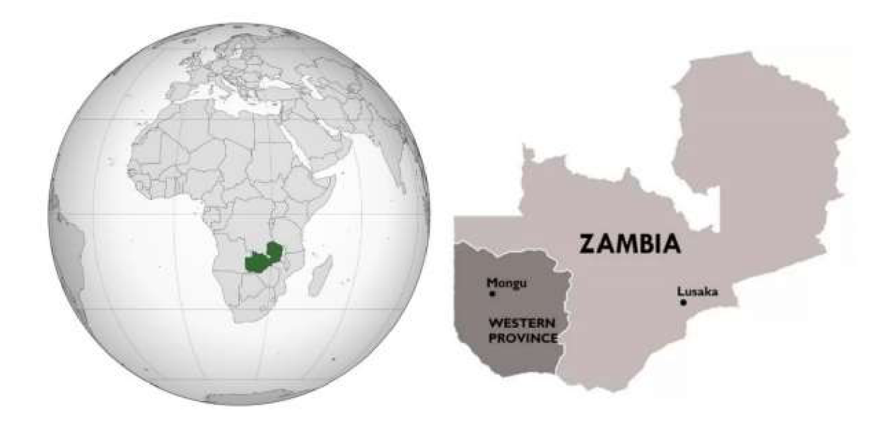
Figure 2. Map of Study Area

The Mongu district was chosen as the location for this study because it is among the districts with peri-urban community setups where renewable energy projects for poverty reduction was introduced and implemented by some international development organizations including Heifer International, SNV – Netherlands, People in Need (PIN) and Swedish International Development Agency (SIDA) (Ghimire 2013). In addition, the households within the Mongu district are mostly small-scale livestock farmers with the potential of supplying the required (needed to power the biogas plant) feedstock (cattle dung) to the domestic biogas digesters constructed under the various renewable energy projects (Sanches-Pereira et al. 2015).