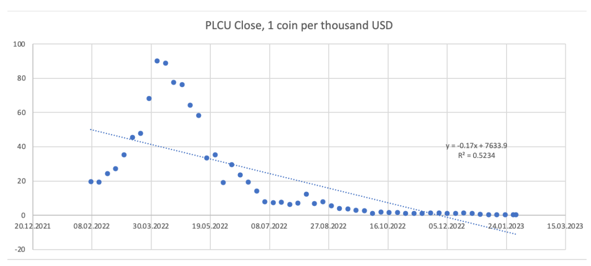
Figure 3: PLCU trend

First, the chapter focuses on creating a trend that will depict the development of the price of PLCU over the course of the selected time period: