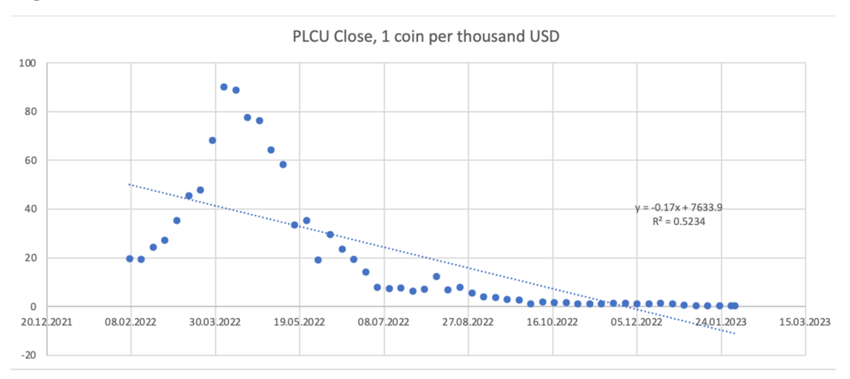
Figure 3: PLCU trend

First, the chapter focuses on creating a trend that will depict the development of the price of PLCU over the course of the selected time period: