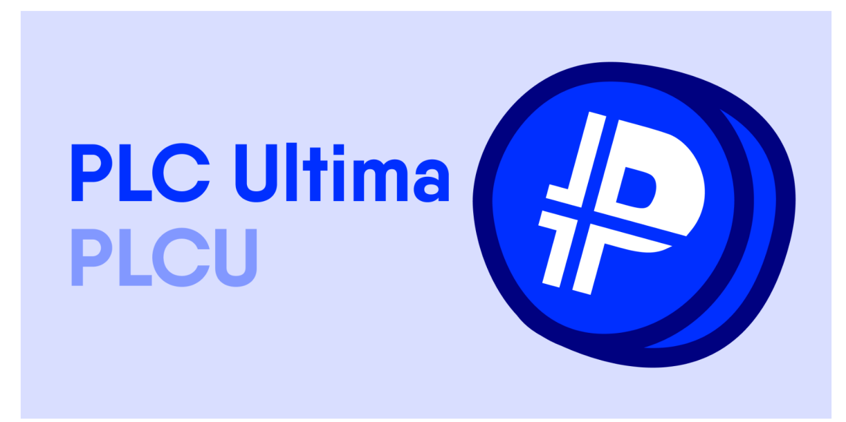
Figure 2: PLCU Ultima logo

PLCU team is employing strategies that rivals in the cryptocurrency space aren't taking advantage of. Open source software first developed in 2011 as a fork of the Bitcoin blockchain serves as the basis for the PLCU blockchain.