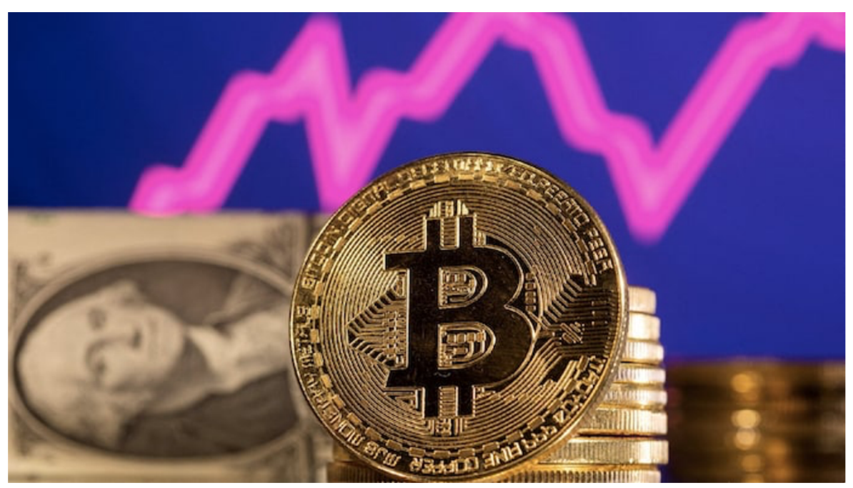
Figure 1: Bitcoin logo on a real coin