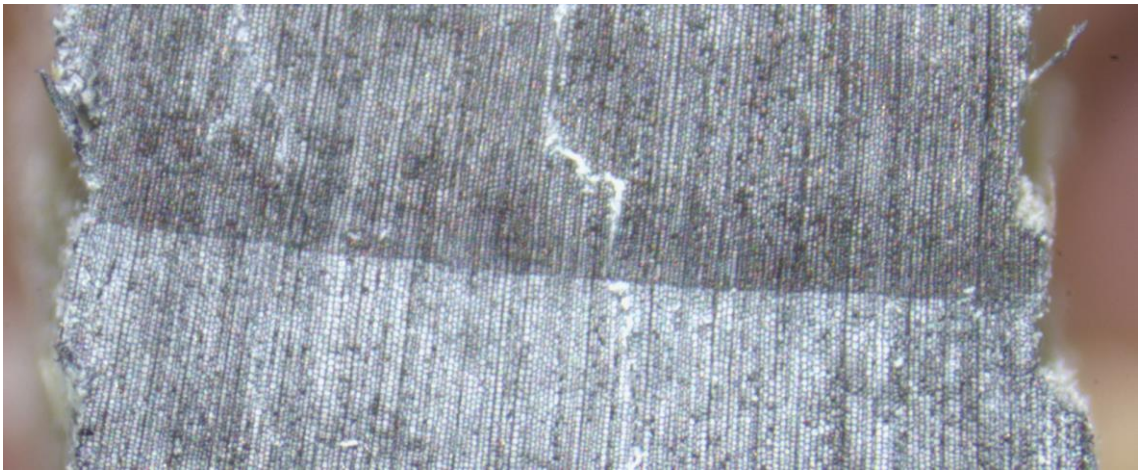
Figure 1: Chip surface preparation

Apply a chalk powder layer on dried out base colour using rubber gloves and a fine brush. If having more chalk fractions, apply the biggest fraction at the first, then continue in application from the biggest to the smallest fraction. Use the brush to smoothly brush off the surface so the chalk would remain only in surface's recesses. Chalk is filling gaps and pores of transverse cut and thus creating contrast between base colour and chalk layer applied. Surface of prepared sample should look like figure 1.