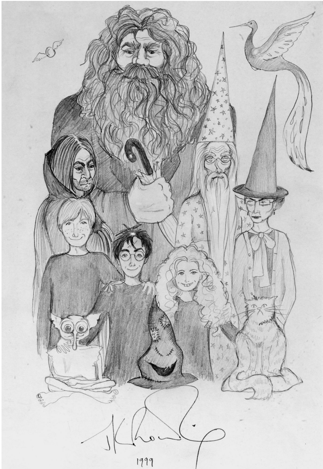
Figure 1: Collective portrait of some of the main characters. Clockwise from the top: Rubeus Hagrid, Fawkes the Phoenix, Albus Dumbledore, Minerva McGonagall, Hermione Granger, the Sorting Hat, Harry Potter, Dobby the House-elf, Ron Weasley and Severus Snape