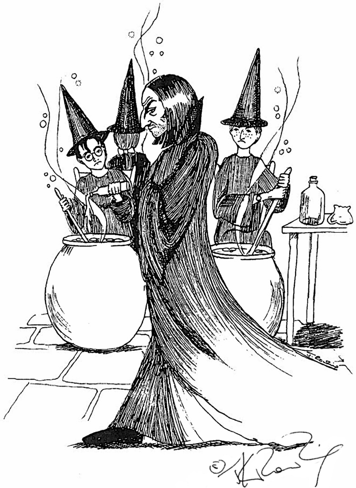
Figure 4: Severus Snape during the Potions class. In the background from left to right: Harry Potter, Hermione Granger and Ron Weasley.