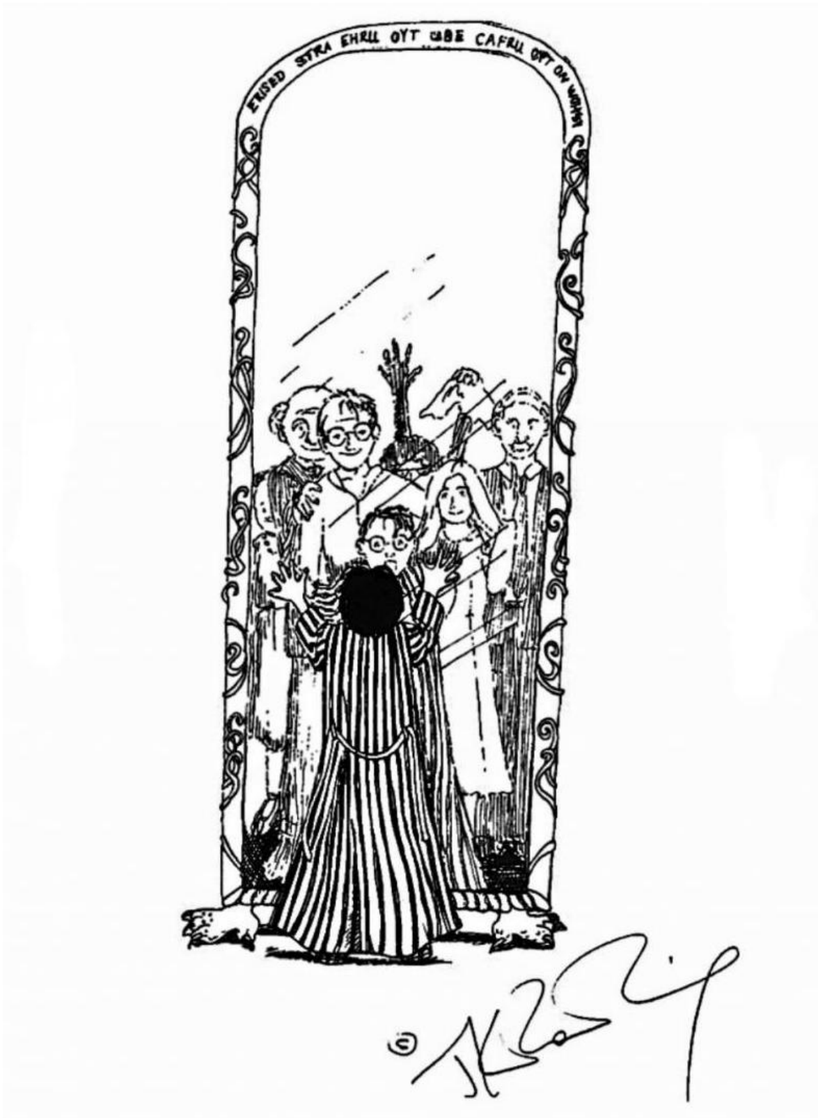
Figure 5: The Mirror of Erised. Harry Potter sees what he desires the most: his parents James and Lily Potter and other relatives.