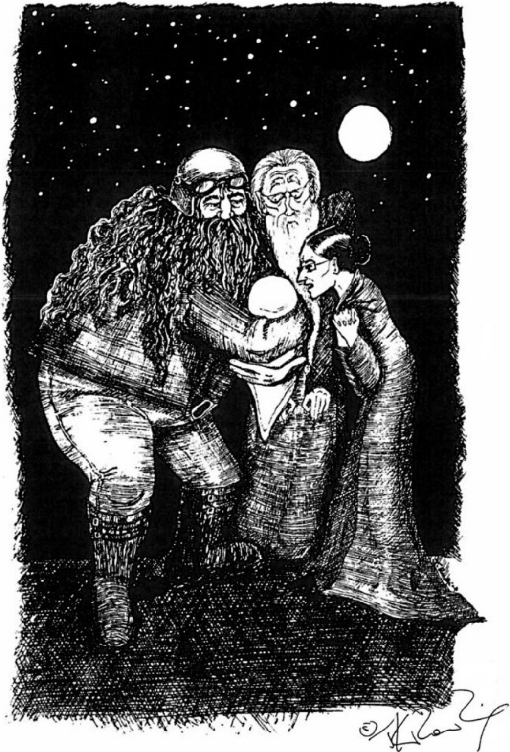
Figure 3: Taking Harry Potter to the Dursleys'. From left to right: Rubeus Hagrid, Harry Potter, Albus Dumbledore and Minerva McGonagall.