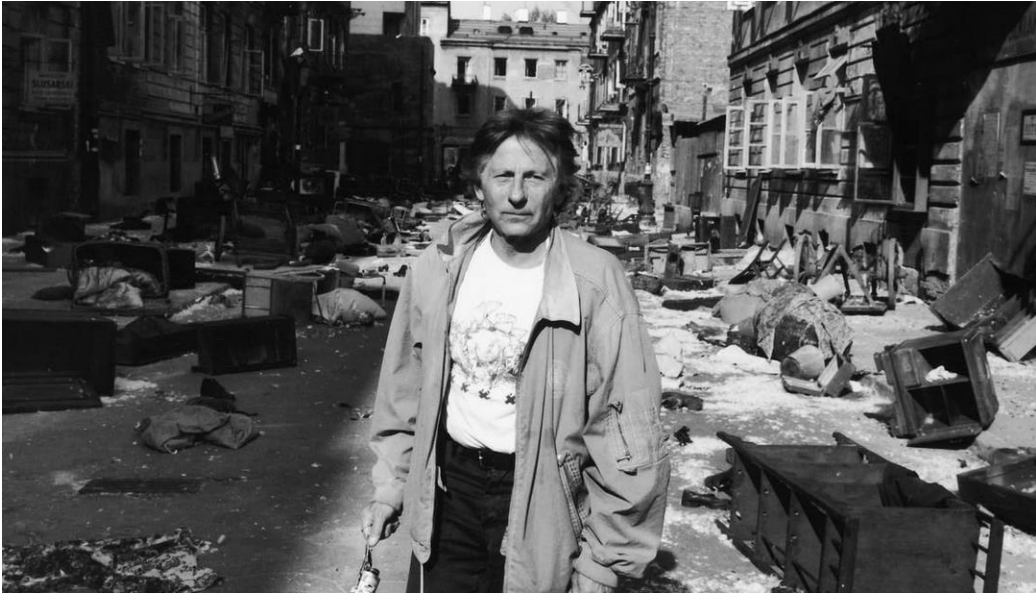
Picture 5. - The portrayal of Roman Polanski