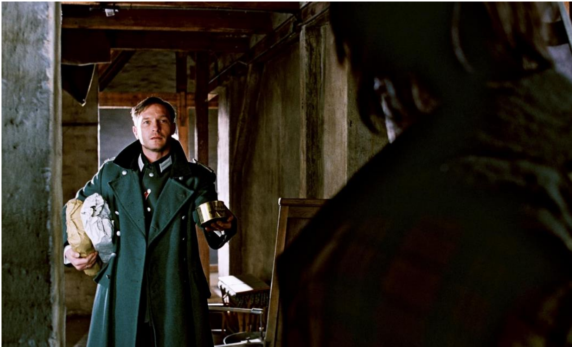
Picture 6. - The scene from the movie "The Pianist" of Adrien Brody and Thomas Kretschmann