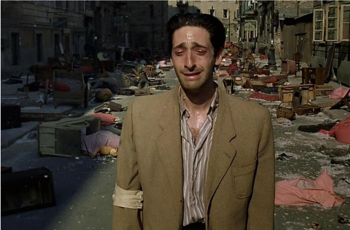
Picture 3. - The portrayal of Adrien Brody