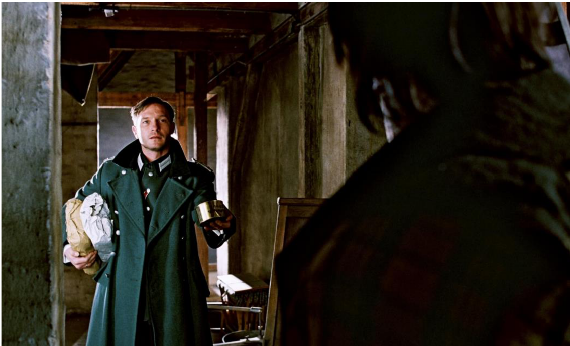
Picture 6. - The scene from the movie "The Pianist" of Adrien Brody and Thomas Kretschmann