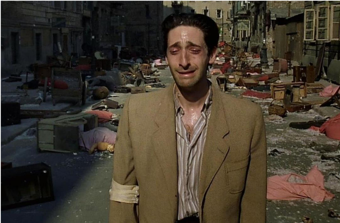
Picture 3. - The portrayal of Adrien Brody