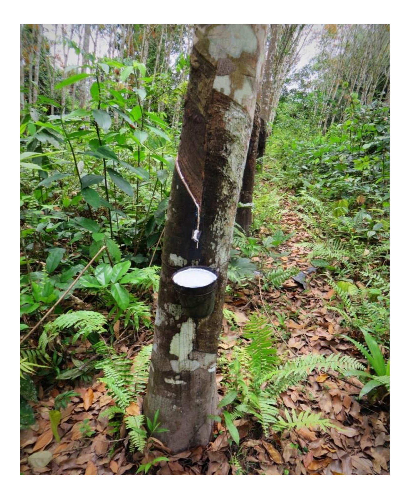
Figure 7 Collecting rubber Hevea brasiliensis in a rubber plantation in Ghana