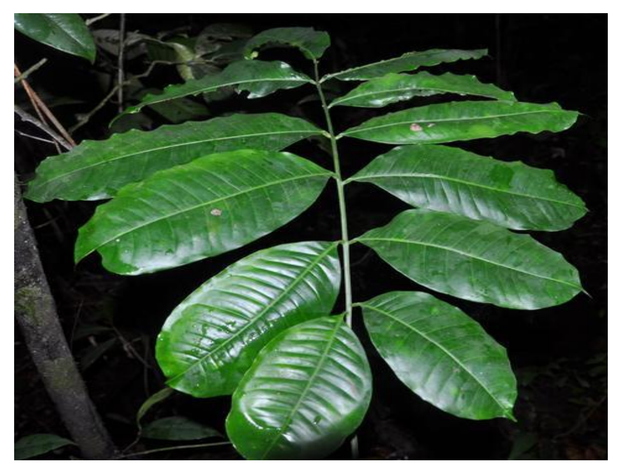
Figure 8 Leaves of E. cylindricum