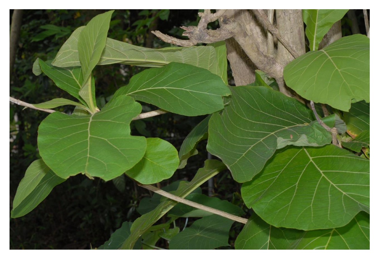
Figure 1 Leaves of Tectona grandis

The leaf is simple, opposite, broadly elliptical or obovate, acute or acuminate, coriaceous, possessing minute glandular dots as shown in figure 1 below. Leaves have a leathery feel, glabrescent above, hairy and scabrous below and is pinnately veined (Palanisamy et al. 2005). Figure 2 is a picture showing a monocultue plantation of teak in Ghana.