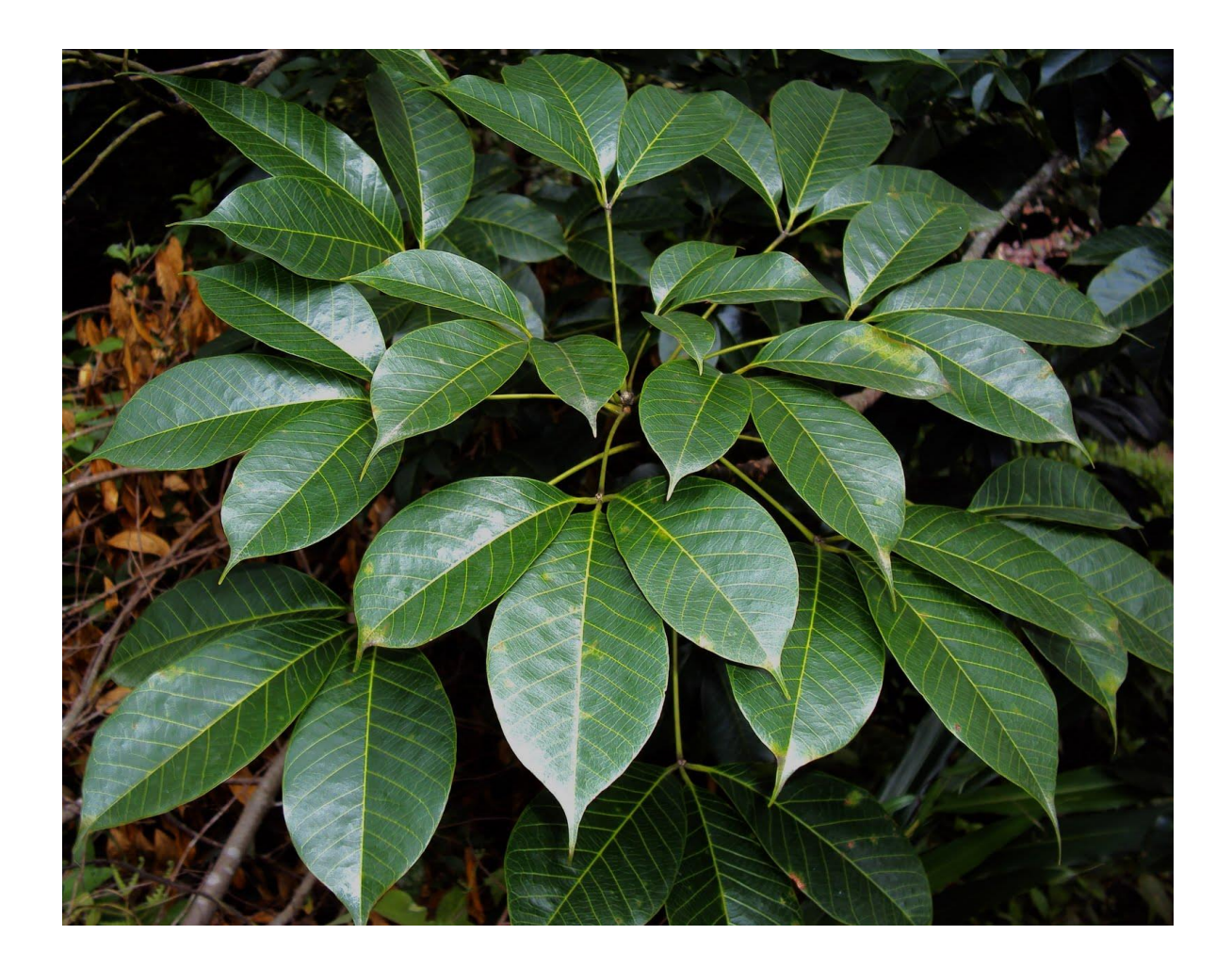
Figure 6 Foliage of rubber tree showing the leathery surface

colour. Inner bark is pale brown, with abundant white latex. Leaves alternate or subopposite at apex of shoot, trifoliate, petioles long with apical glands as seen in figure 6. Leaflets are elliptic or obovate, 4-50 cm x 1.5-15 cm, entire and pinnately veined (Westphal & Jansen 1989). Figure 7 shows the process of latex tapping in a rubber farm.