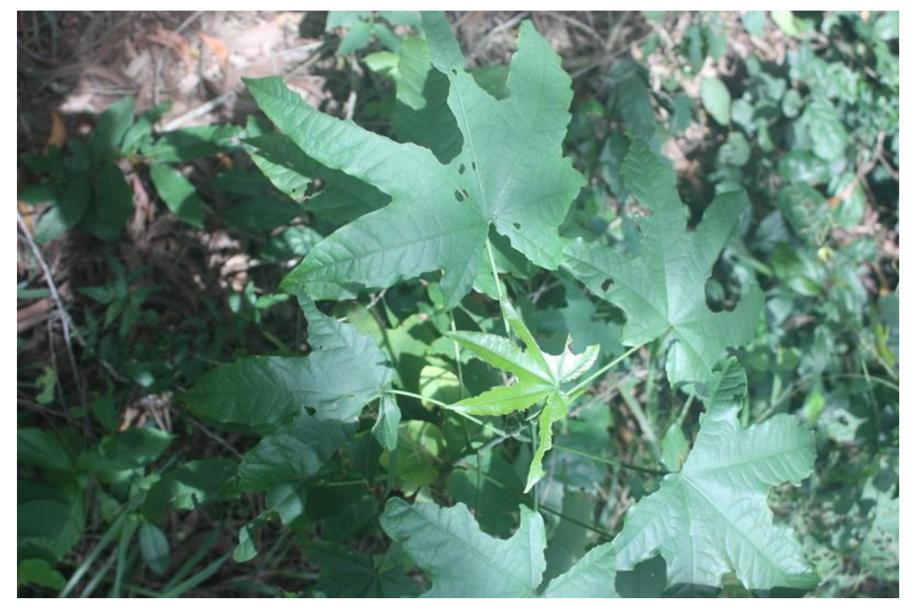
Figure 3 Leaves of T. scleroxylon

The leaves are simple palmate, mostly 5-7 lobed, about 8cm long and 10cm wide as shown in figure 3. The margin is entire, cordate and glabrous with a petioloe of about 4cm long. The stem of the tree is usually straight and unbranched up to about 25m and sharp extensive buttresses (illustarted in figure 4) extending to 8m up the trunk (Oteng-Amoako 2006).