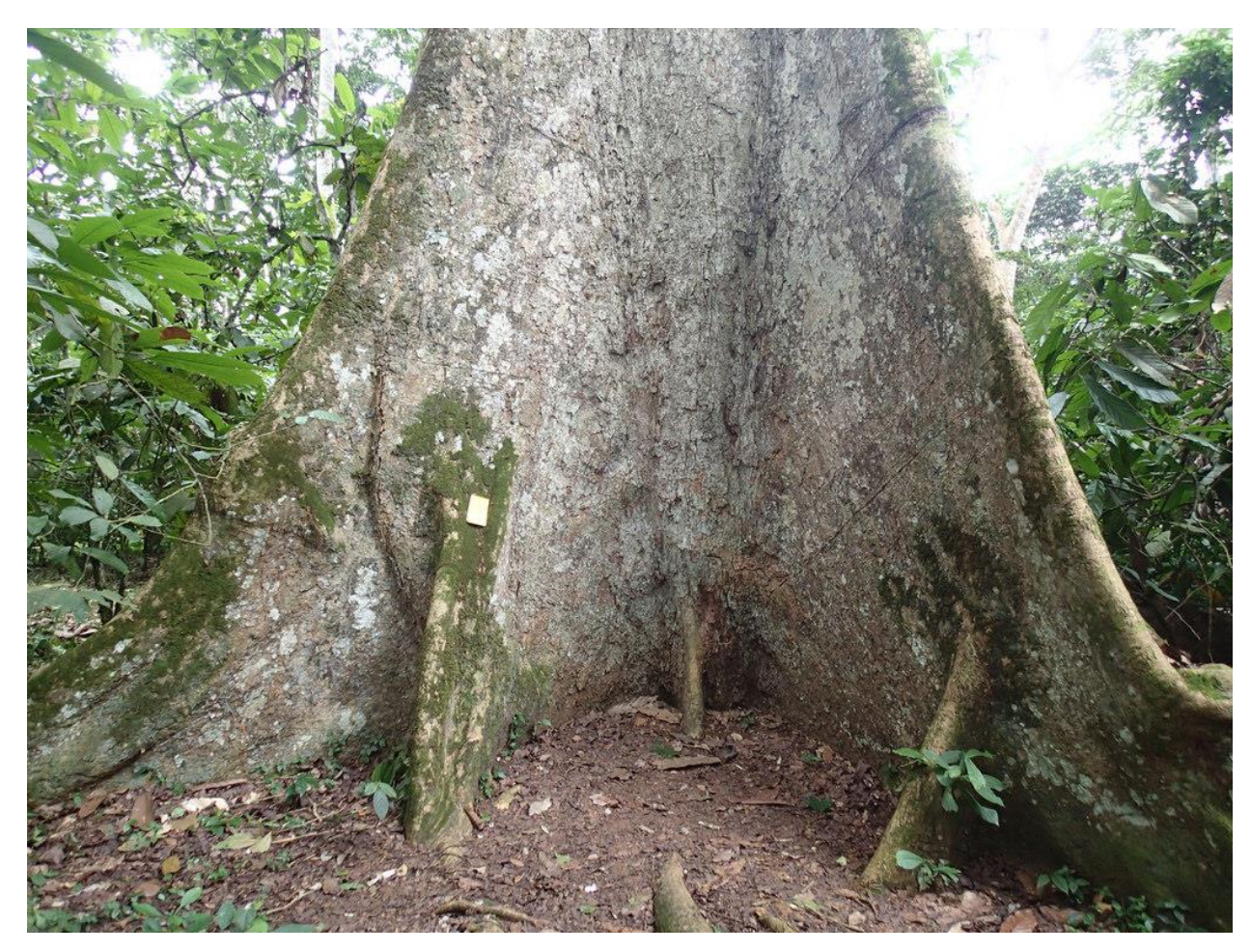
Figure 4 Buttress system of Triplochiton scleroxylon