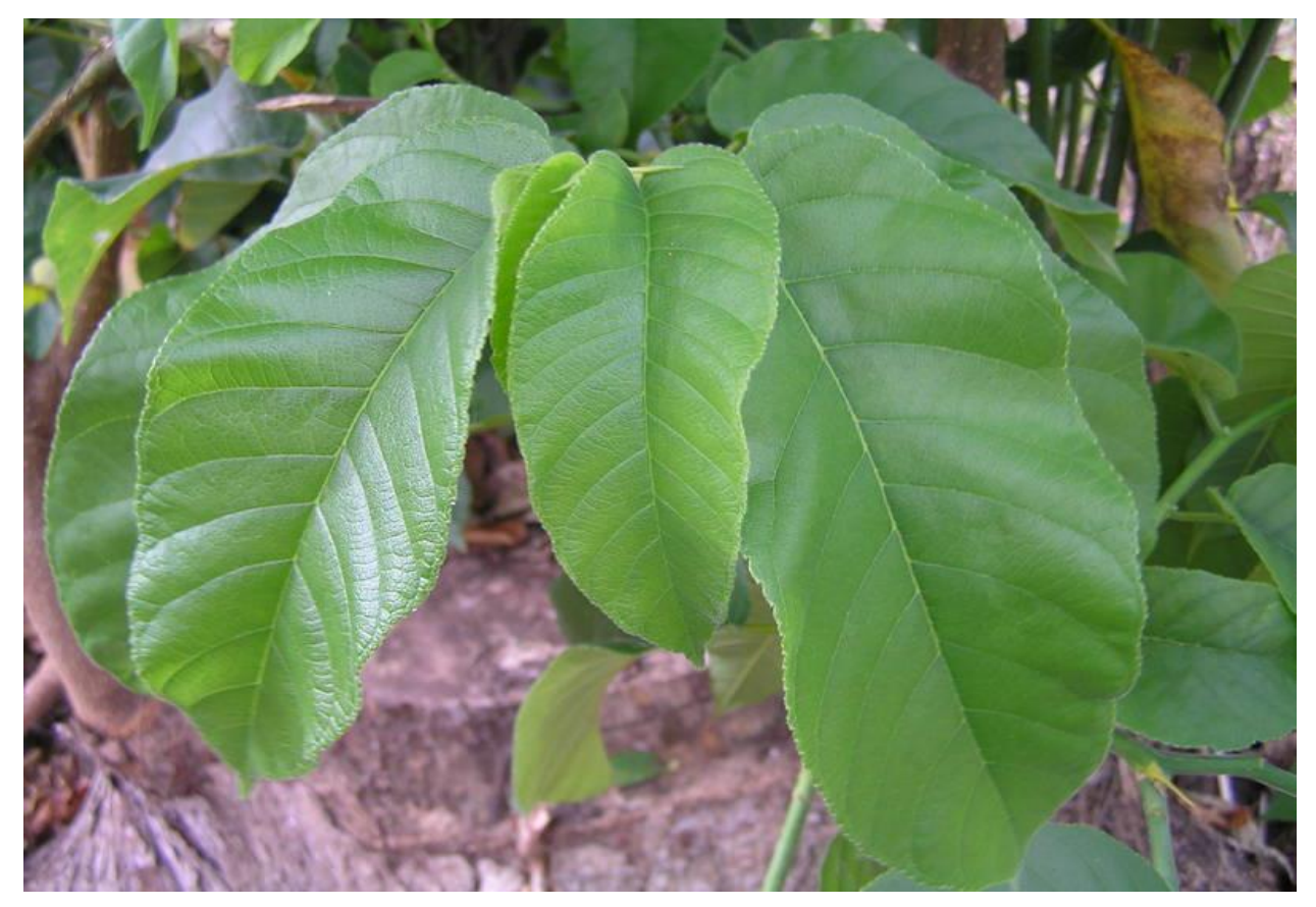
Figure 5 Leaves of Milicia excelsa

rectangular mesh of veins that are conspicuous on the under surface; base subcordate; apex shortly acuminate; edge finely toothed; stalk 2.5-6 cm, stout and glabrous (Berg 1982).