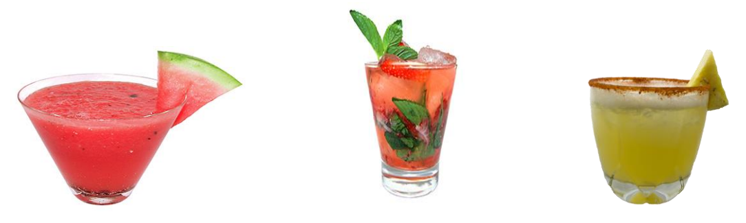
Image 24 Mezcal Cocktail Image 25 Mezcal Cocktail Image 26 Mezcal Cocktail

Source: La Mil Amores, 2017 Source: La Mezcaliña, 2017 Source: La Mil Amores, 2017