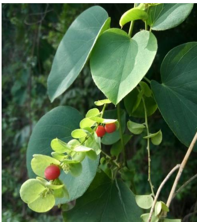
Figure 3. Cissampelos pareira , plant with the broadest spectrum of isoquinolines [234]