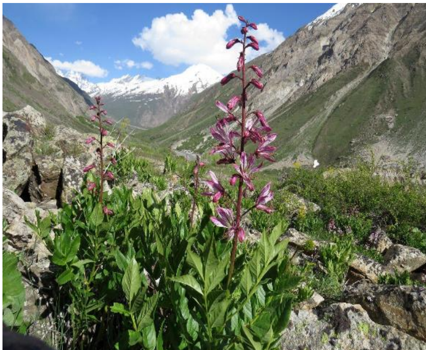
Figure 2. Dictamnus angustifolius , plant with the broadest spectrum of quinolines [233]