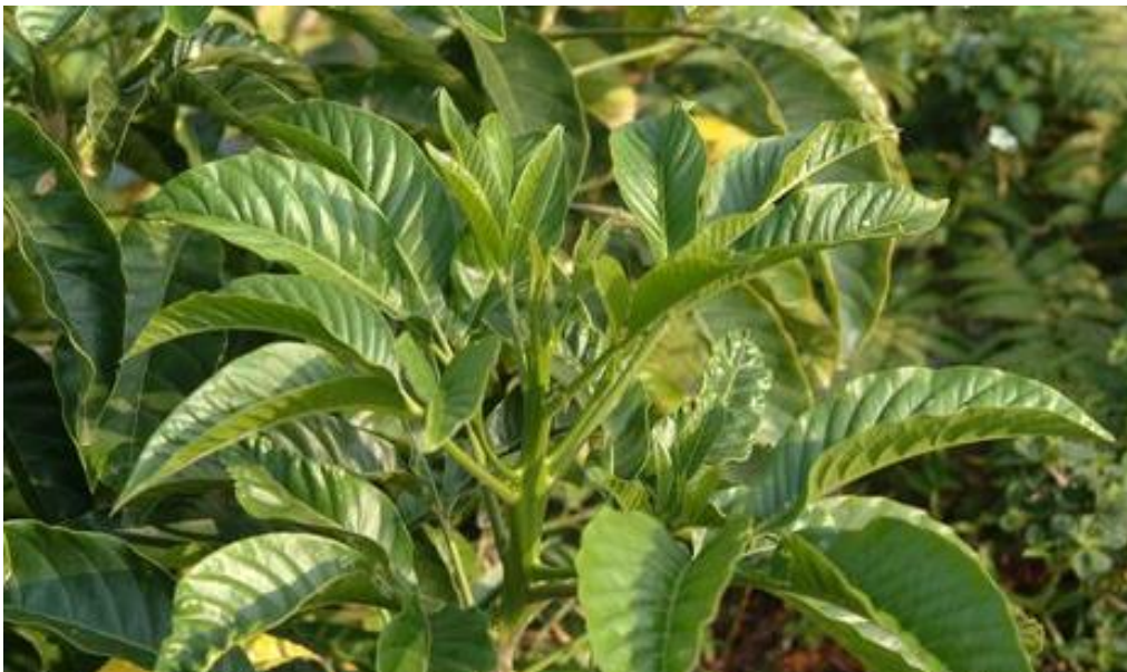
Figure 5. Melicope semecarpifolia , plant with the highest content of antiproliferative agents [236]