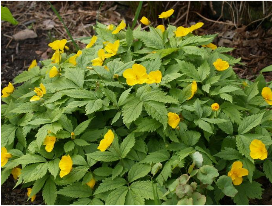
Figure 4. Hylomecon japonica , plant with the highest content of antibacterial agents [235]