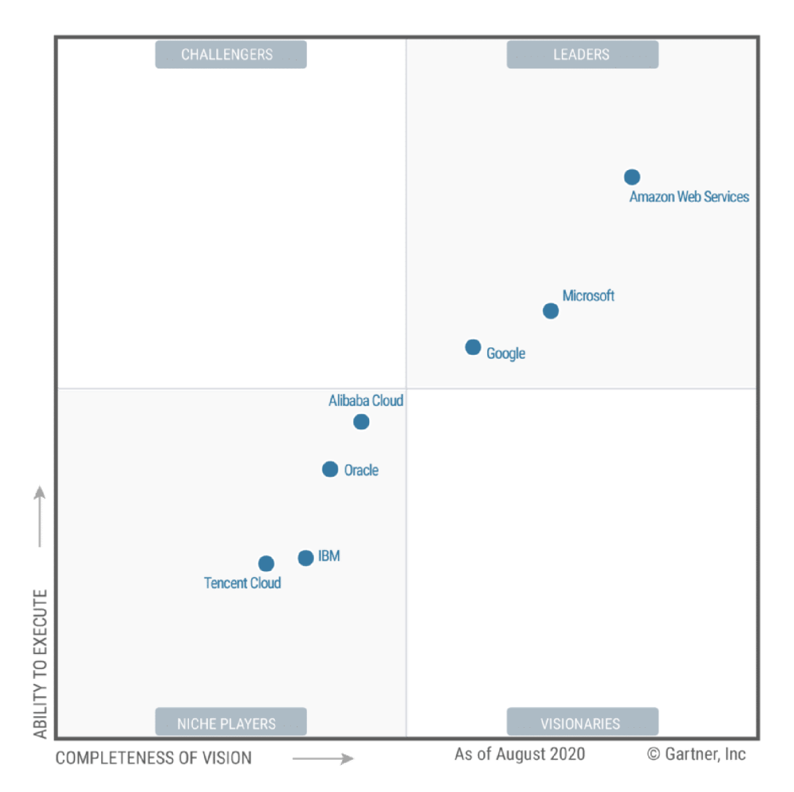
Figure 2. 2020 Magic Quadrant for Cloud Infrastructure as a Service, Worldwide