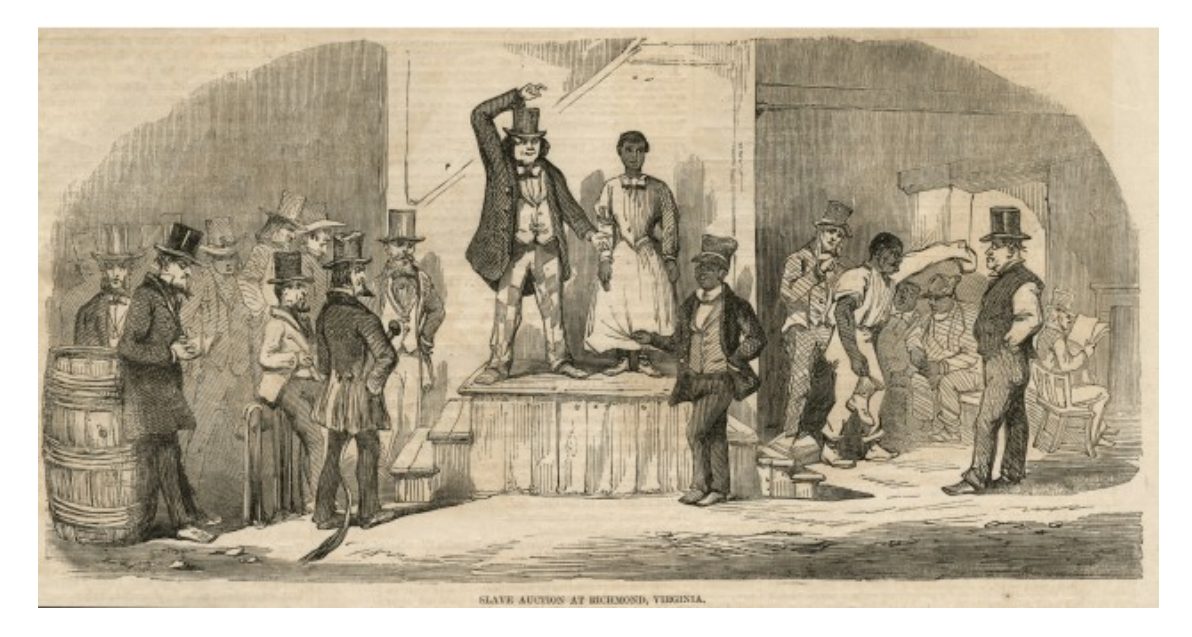
Figure 2: Slave auction at Richmond, Virginia. 1856 [14].

house servants or in other jobs that required close contact with the Whites. That is the reason why almost only private slave sales were performed there, often with the presence of a physician. The sales in the South were much more massive, planters bought slaves in large quantities and did not care that much about their health [7]. Families were usually split on the markets, mothers were just rarely bought together with their children. Although the importation of slaves to the United States had been prohibited since 1808, the trade continued illegally until the outbreak of the Civil War.