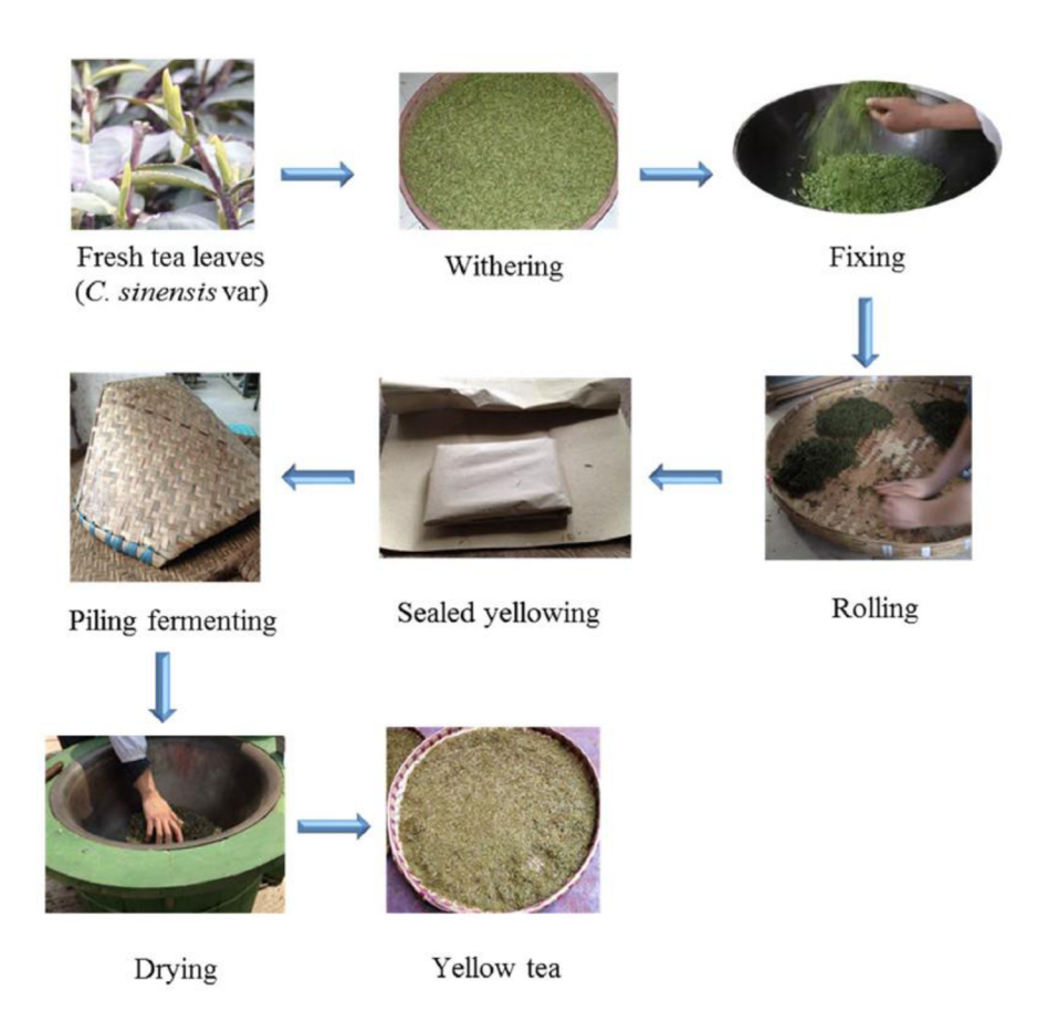
Figure 13. Steps of Yellow tea processing

The fermentation process as well as the brewing affect caffeine content in some way. The longer brewing takes, the more caffeine tea contains. Other factors that influencing caffeine content include the parts of the plant used for tea processing, with tea buds containing more caffeine than the leaves ("Effect of Fermentation on Caffeine Content in Tea – teavivre" n.d.).