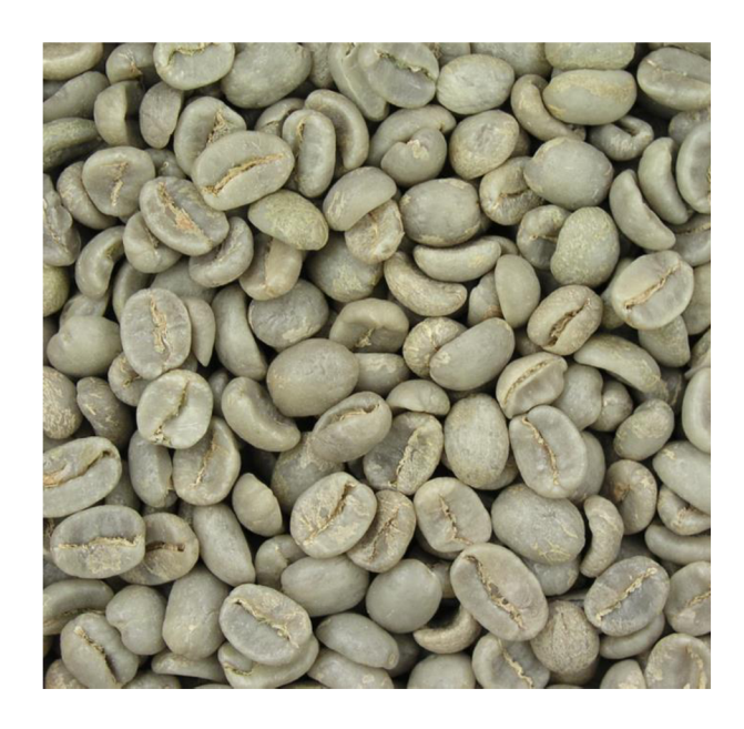
Figure 4. Green coffee beans