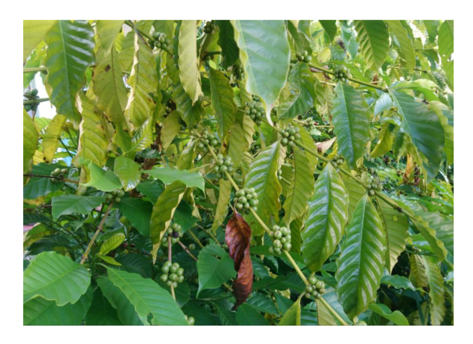
Figure 3. Coffea arabica