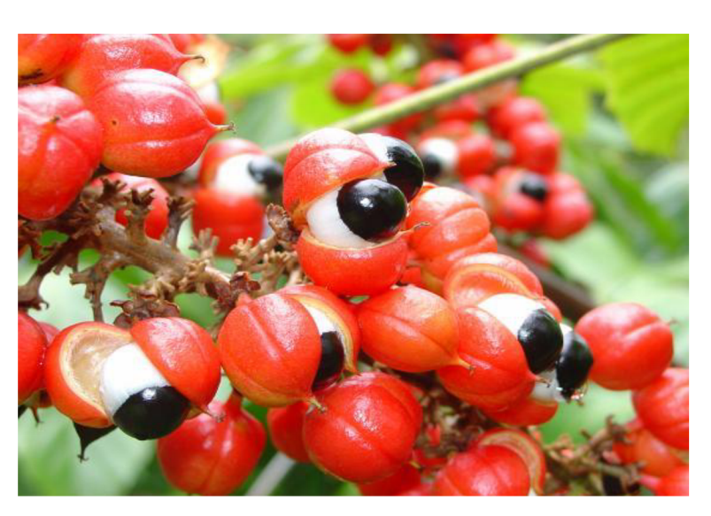
Figure 6. Guarana fruits

Products derived from guarana seeds have found application in soft drinks, concentrated beverages, and in products for the weight-loss purposes (Majhenič et al. 2007). Nevertheless, excessive consumption may harshly impact health of the human by causing anxiety, sleep disturbances and tachycardia; these consequences are attributed mainly to the rich caffeine concentration in the plant (Smith & Atroch 2010; Wikoff et al. 2017).