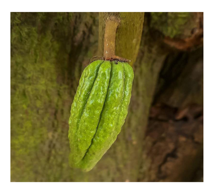
Figure 8. Theobroma cacao fruit

Due to human activity, cacao has been spread around the globe, initially to Mesoamerica and subsequently to Asia and Africa. Cacao cultivation provides the chocolate industry with cocoa liquor, cocoa butter, and powder to contribute not only to health improvements but also to an exquisite flavour (Kris-Etherton & Keen 2002). Cocoa butter, extracted from cocoa beans, also finds applications in the pharmaceutical and cosmetic sectors. It possesses specific characteristics that are incomparable with other fats (Zyzelewicz et al. 2014). It is important to mention that the cocoa beans fermentation process is necessary for the development of precursors essential for the formation of chocolate flavour. The taste of raw cocoa beans is bitter and unsavoury; that is why fermentation and drying are required to develop the cocoa flavour and aroma (Ho et al. 2014).