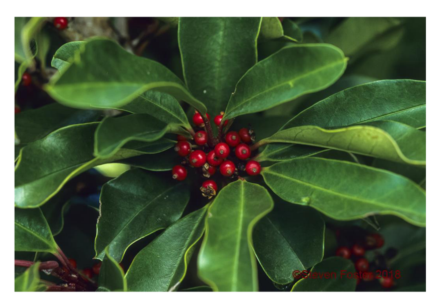
Figure 7. Ilex paraguariensis plant,

The yerba mate powder, derived from the leaves, is rich in caffeine and is also used as an alternative to both tea and coffee. The roasted leaves steeped in hot water are known as mate tea, which is also used as an ingredient in soft drinks (Lima et al. 2014). The powder is recognized for its medicinal attributes, such as antioxidant, anti-inflammatory, antitumor and weight-loss properties (Bracesco et al. 2011).