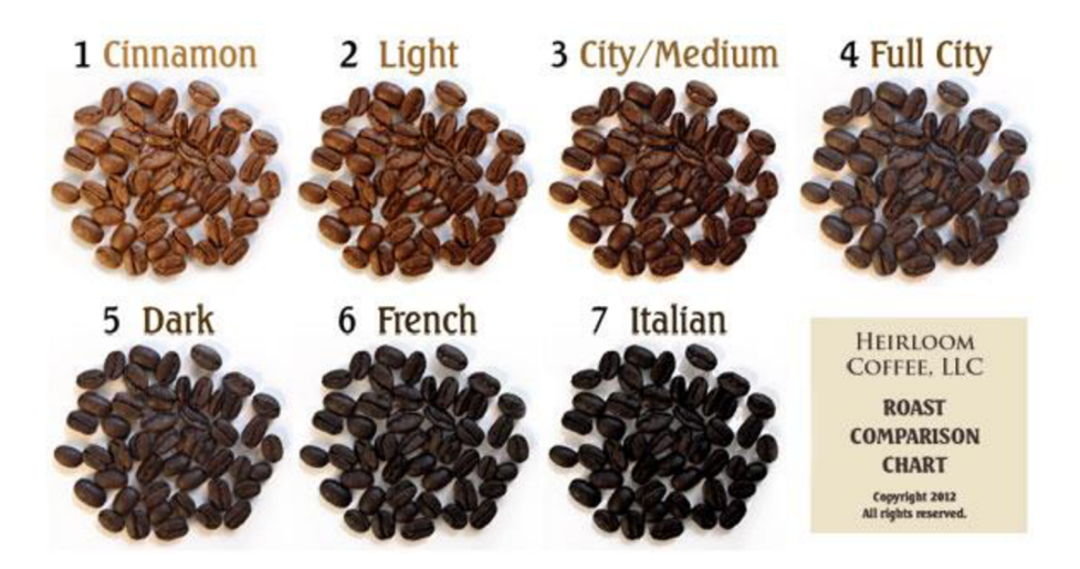
Figure 11. Roast comparison chart

During the roasting process, coffee goes through structural, physical, and sensory alternations. It is a process that differs around the globe, but in general, coffee is subjected to high heat depending on various factors such as roaster type, coffee beans origin, and aroma and flavour characteristics (Latosińska & Latosińska 2017).