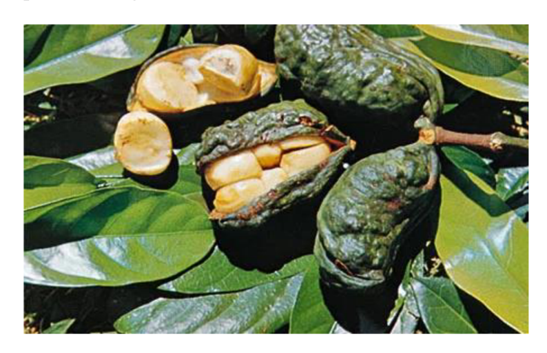
Figure 9. Cola nitida

The seeds of Cola species, or cola nuts are suitable for consumption but difficult to digest (Olaoye 2022). The cola seeds are well-known for their high caffeine concentration, as well as theobromine, kolanin, L-epicatechin, and d-catechin (Lowor et al. 2010; Erukainure et al. 2017). Each seed contains about 1-1.5% caffeine per weight. The flavour is distinctly bitter, and this bitterness is caused by secondary metabolites and polyphenolics (Lowor et al. 2010). Cola nitida seeds are generally chewed or used for their stimulant effects by inhabitants. They also play an important role during social and ceremonial activities in Africa. Even a small amount of cola seed can have a positive impact on cognitive functions, weight loss, reduce the urge for sleep, hunger, and thirst. Cola seeds are also widely used for essential oils, drugs, softs drinks, wines, candies, and for pharmaceutical products (Jayeola 2001; Dah-Nouvlessounon et al. 2015).