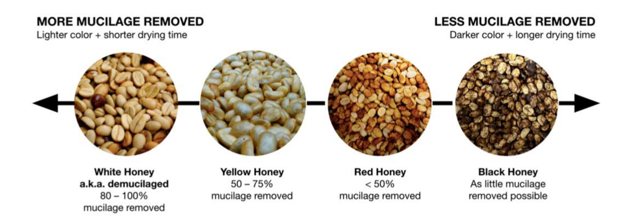
Figure 10. Honey coffee beans