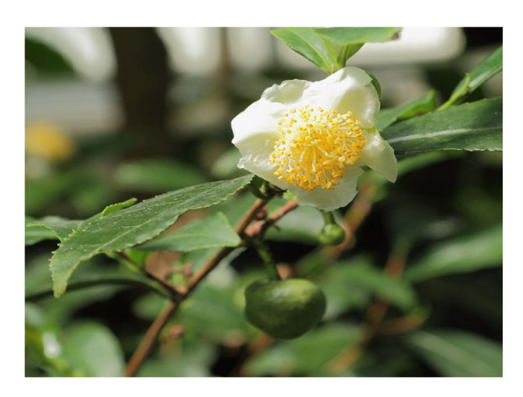
Figure 5. Camellia sinensis

Cam. sinensis is an evergreen plant, a shrub, or a small tree, reaches up to two meters or less when cultivated for its leaves. Tea leaves of various ages possess distinctive qualities owing to their varying chemical composition. For tea production, it is preferable to harvest young, light green leaves. As the leaves age, their colour becomes more of a dark green colour. For processing, the tip and two or three leaves are selected. The manual picking process is repeated every one or two weeks. The picking process is also conducted through machines, which may be more efficient for tea quality and may lessen leaf damage. The plant produces white and yellow-coloured flowers and the seeds of Cam. sinensis and Cam. oleifera can be used to extract both tea oil (slightly sweet seasoning) and cooking oil, which is often confused with tea tree oil (Mahmood et al. 2010; Tian et al. 2021).