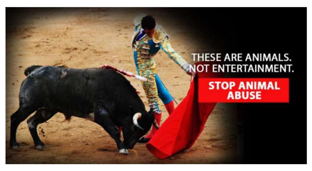
Figure 3-2 Micro-targeted advertisement created by Vote Leave