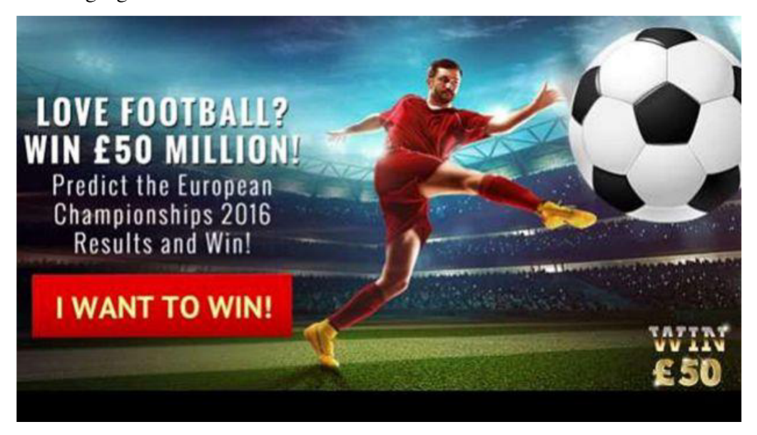
Figure 3-1 Advertisement on the contest

There was also an advertisement that took you into a contest to win fifty million pounds if you guess correctly who will win in each fifty-one game in the 2016 European football championship (BBC News, 2018). Presumably, as similar contests on the internet, you have to input your personal information to be able to participate, therefore it is another way to gather data about potential voters. The advertisement can be seen in the following figure.