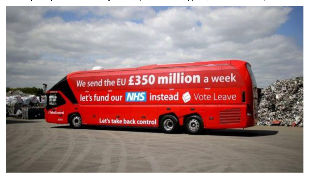
Figure 1-2 Advertisement created by Vote Leave

1975 the public figures were seen as extremist, in 2016 the public figures were seen as normal participants of democracy that the public could support (BBC News, 2016).