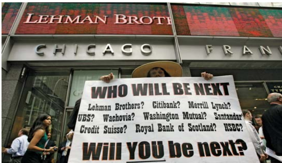
"A demonstrator holds up an ominous placard outside the headquarters of Lehman Brothers in New York"