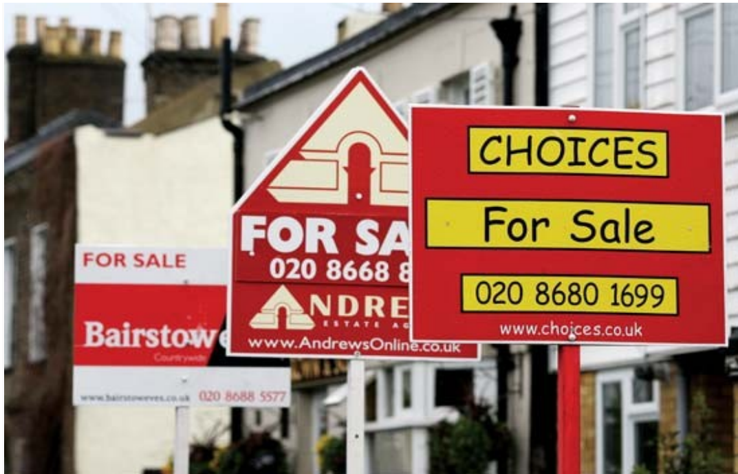
"Signs advertising residential property for sale line a street in south London in April 2008"