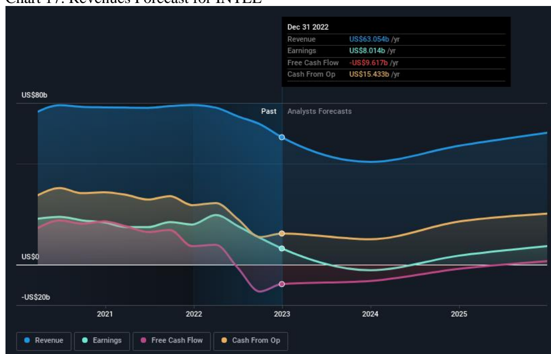
Chart 17. Revenues Forecast for INTEL

https://simplywall.st/stocks/us/semiconductors/nasdaq-nvda/nvidia/future