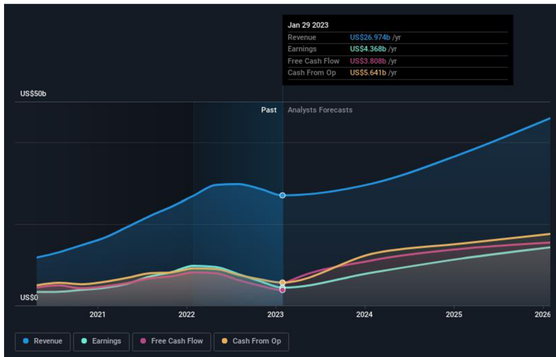
Chart 33. Liquidity Ratios