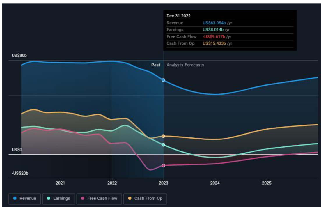
Chart 17. Revenues Forecast for INTEL

https://simplywall.st/stocks/us/semiconductors/nasdaq-nvda/nvidia/future