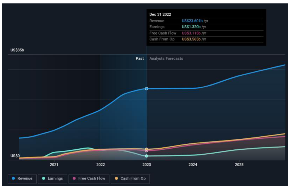
Chart 15. Revenues Forecast for AMD

https://simplywall.st/stocks/de/semiconductors/etr-amd/advanced-micro-devices-shares/future