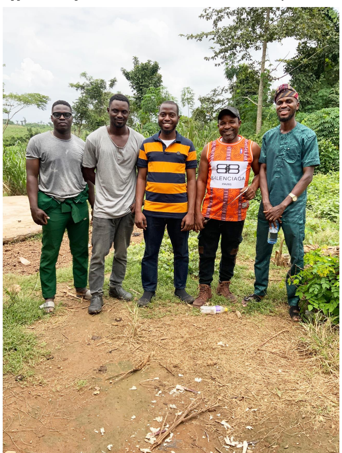
Appendix 6: A picture with some of the farmers in the study area