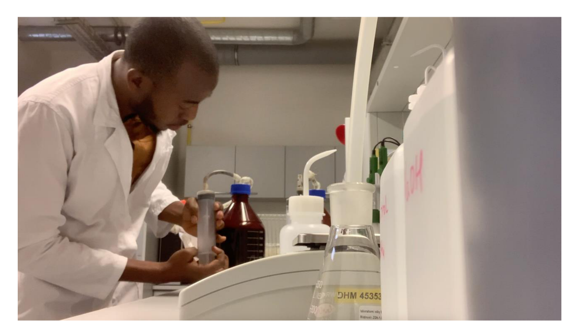
Appendix 5: Taking samples for pH and ORP test.