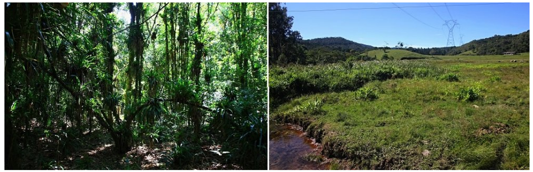
Figure 9: Examples of environments on transect.