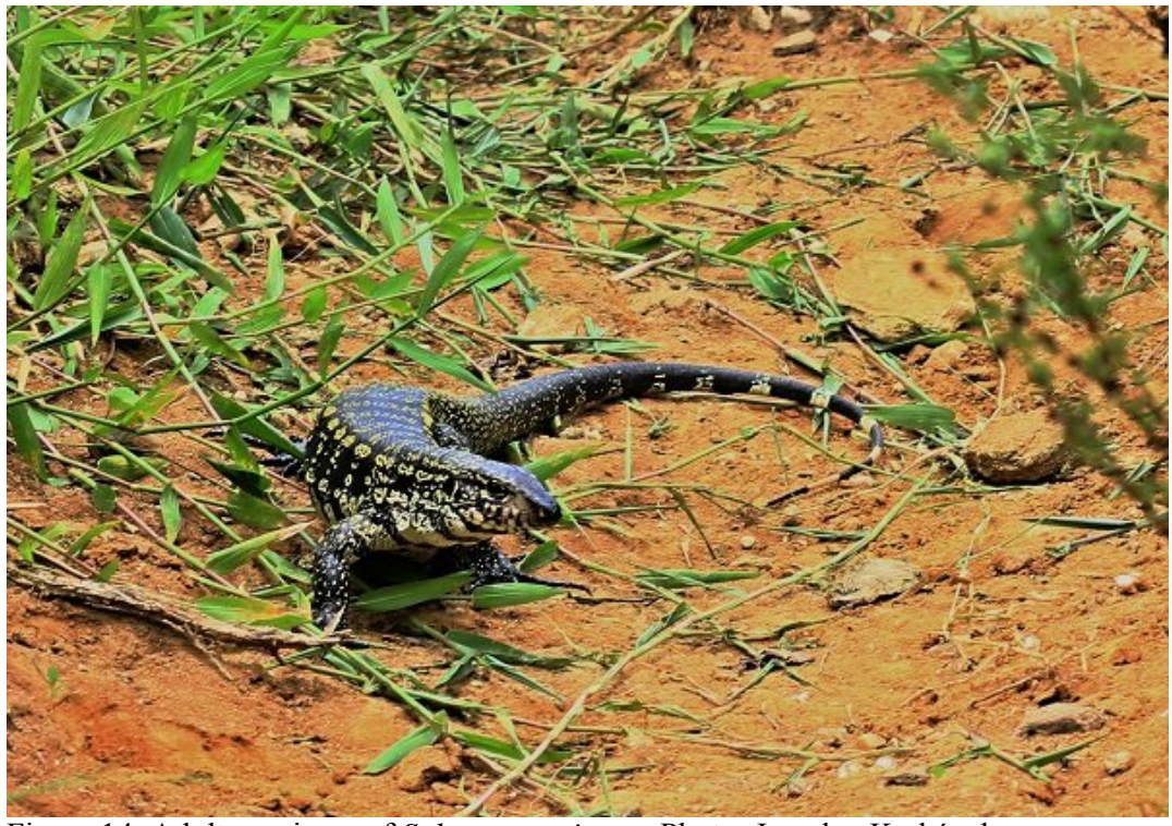
Figure.14: Adult specimen of Salvator merianae , Photo: Jaroslav Karhánek. <u>Family:</u> Teiidae

This species was observed 4 times on the transect number II on the pasture part between house and forest. We were unable to capture those animals for detail study, to take their size and better photography. They are very fast and careful during day. At night they are resting hidden in the holes, under rocks or logs. They were observed only in the morning when they were obtaining energy from sun, they were partly hidden or moving in the vegetation on the pasture in the grass or in the bush. The fly distance was around 10 m. All 4 individuals were adults, most probably 2 males (Fig.14) and 2 females according to body physique (male were robust in body and head, also much larger in length), size was estimated from 75 up to 120 cm.