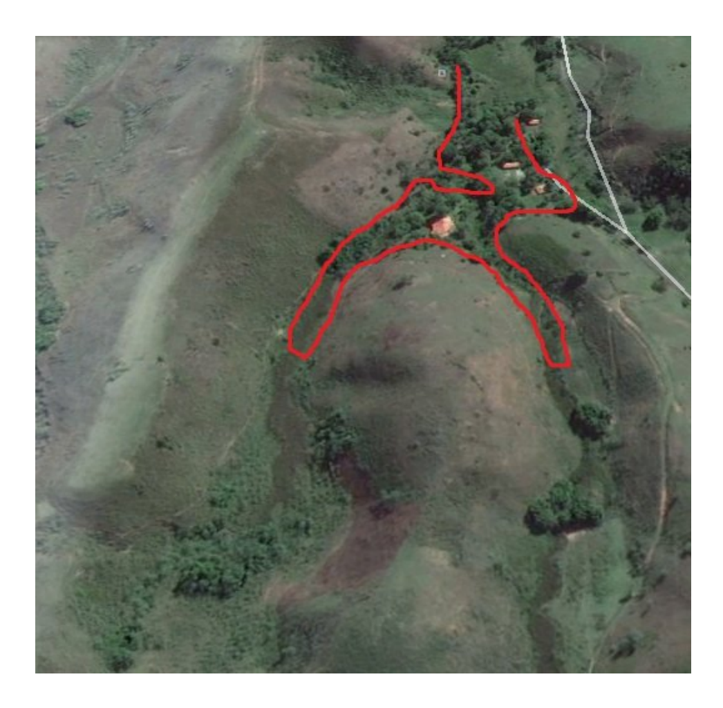
Figure 2: Lucia transect, scheme map.