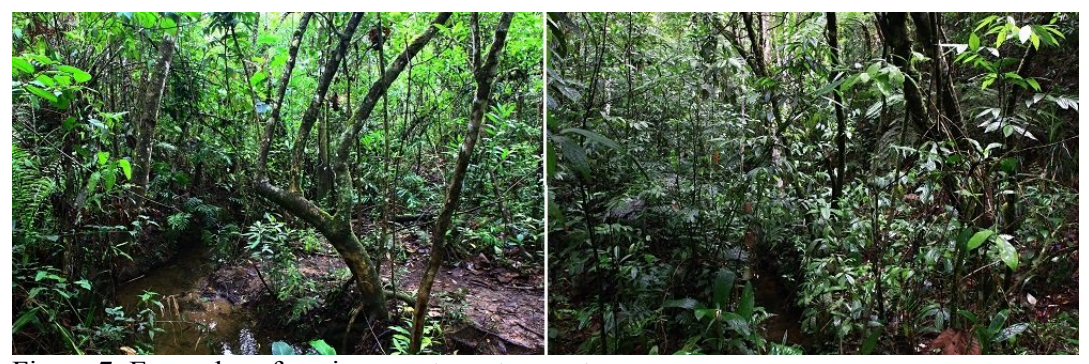
Figure 7: Examples of environments on transect.