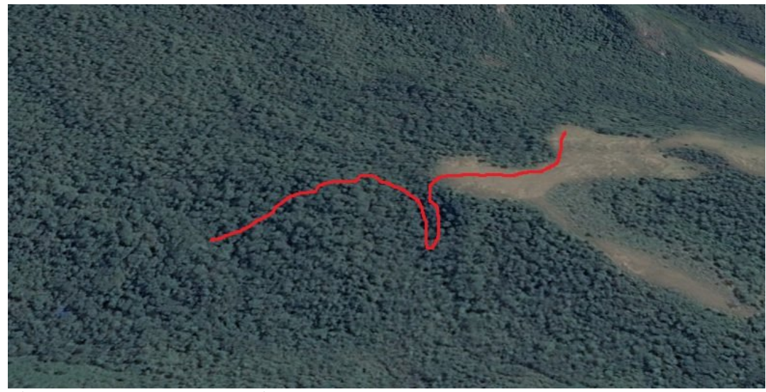
Figure 6: Pesegao transect, scheme.