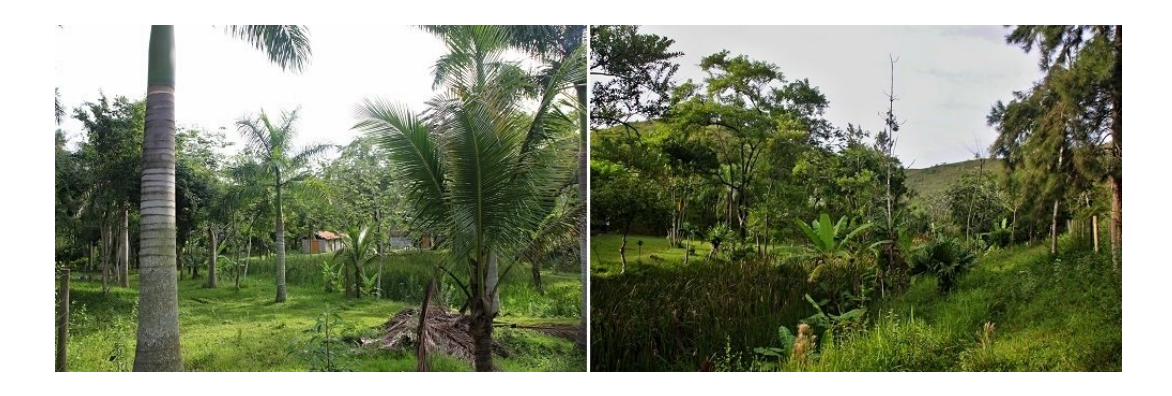
Figure 3: Examples of environments on transect.