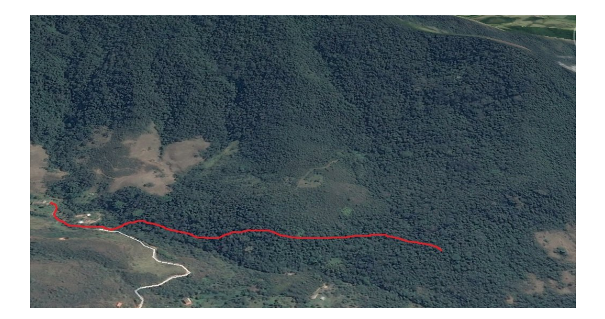
Figure 4: Xandoca transect, scheme map.

The second transect was designed in mid elevation between 600 and 700 m a.s.l. and was designed to include fragment of primary forest and secondary forest with small part of cultivated land. This area is also under private privacy. It was designed to go through the dense forest edge. Presence of cattle or another domesticated animals was not observed directly on the transect. Forest area was in close distance of water stream or was directly situated along it. Study site was rough with steep hills, only few plateaus were presented. The trail was not very clear, had to been re-cut to allow searching. The vegetation was dense, especially at some parts. Low vegetation with larger amount of shrubs and fallen branches, trees. The most parts of ground were covered by leaf litter. In some forest parts of the transect were larger amount of rocks and small caves but without any chance to enter into those cages because of their relative small size. Relatively small amount day light is presented during whole day in the forest because of high density of canopy. The temperature was very similar during day and night with small drop during night. Humidity was higher, dependent on rain which had big influence on it, especially at night. The stream was after heavy rains often swollen and very fast for several hours.