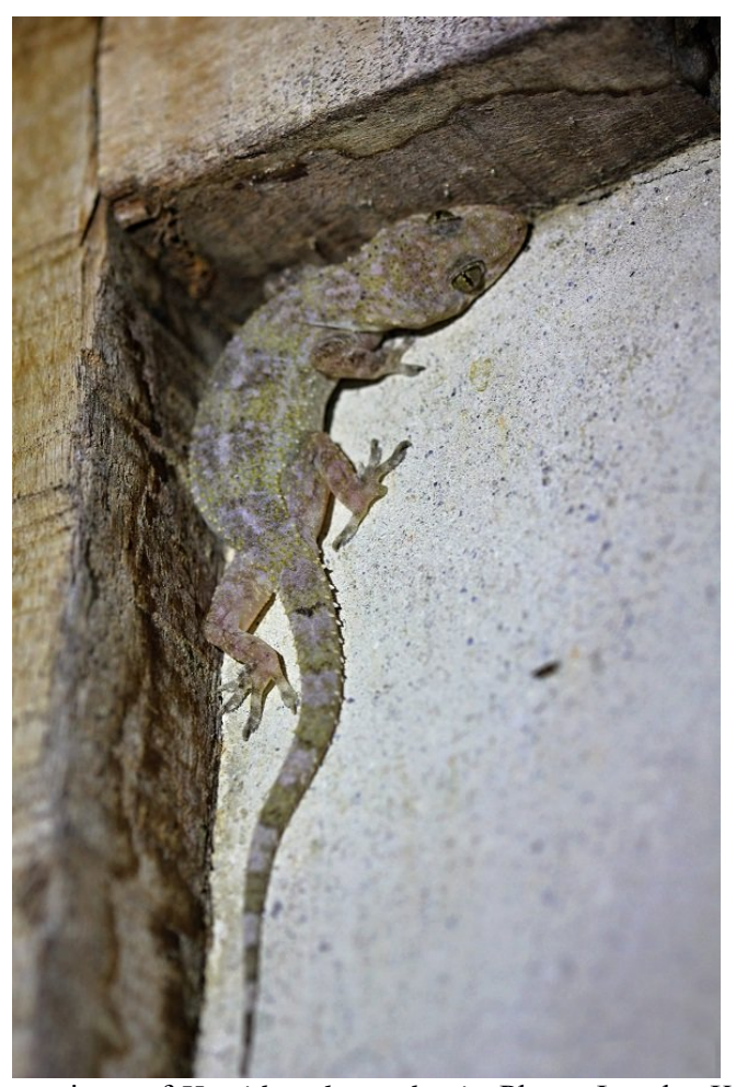
Figure 17: Adult specimen of Hemidactylus mabouia , Photo: Jaroslav Karhánek. <u>Family:</u> Gekkonidae

Hemidactylus mabouia Moreau de Jonnes, 1818