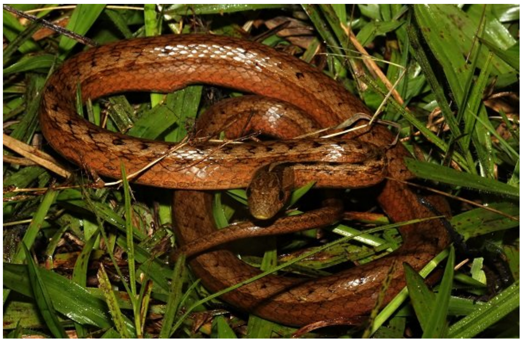
Figure 12: adult specimen of Thamnodynastes strigatus. <u>Family:</u> Dipsadidae

It were found 3 individuals in total, only on transect number IV. First individual was DOR specimen found on the road, juvenile animal of the total length of 28 cm. Another two specimens were found at night, around 10 PM. One animal was juvenile, around 27 cm long and the second adult animal (Fig.12) around 65 cm in length. Both animals were found in wetland area hanging on bushes in ambush position above water, probably waiting for the prey, frogs. At the beginning of the manipulation they were very active, trying to intimidate us by strikes with open mouth and inflating the body. The coloration was classic for the species, the juvenile was more light in compare of adult animal.