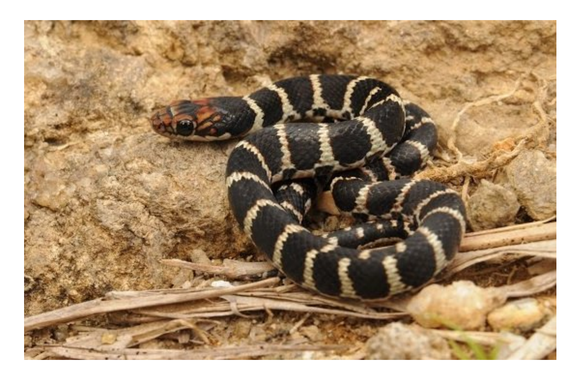
Figure 13: Juvenile specimen of Erythrolamprus poecilogyrus , Photo: Dalibor Sýkorovský.