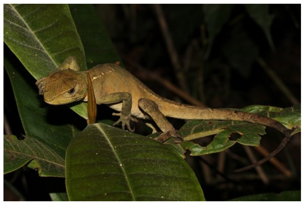
Figure 16: Adult specimen of Enyalius iheringii , Photo: Jaroslav Karhánek. Family: Leiosauridae

There were found only 2 individuals (Fig.16) on transects number III – Pesegao and transect IV – Bruno on forest edges. Both of the individuals were adult males which were found at the night sleeping on the branches, one of them on transect number three – Pesegao in heavy rainfall. The total size of both individuals were 25 cm and 27 cm.