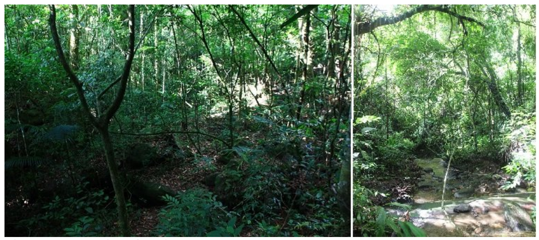
Figure 5: Examples of environment on transect.