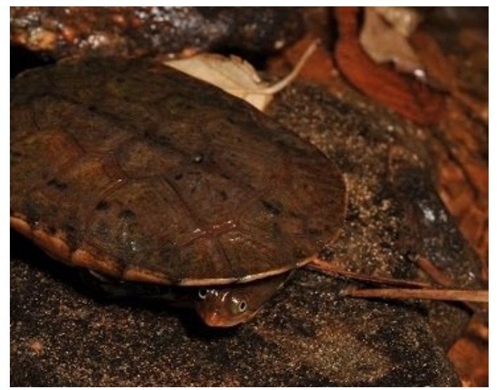
Figure 19: Adult specimen of Hydromedusa tectifera , Photo: Dalibor Sýkorovský. <u>Family:</u> Chelidae

It was observed only one sample (Fig.19), the turtle was found only in transect number II in forest in small pond under the waterfall and in surrounding were steep hills and difficult terrain. It was an adult male. It is interesting that he was able to live there. Not enough food in the pond (fish, shrimps). He was probably migrating to find new territory and ended in that pond for some time. From the pond was flowing small stream through the forest to large stream where at one point was established big pond from which he was probably migrating.