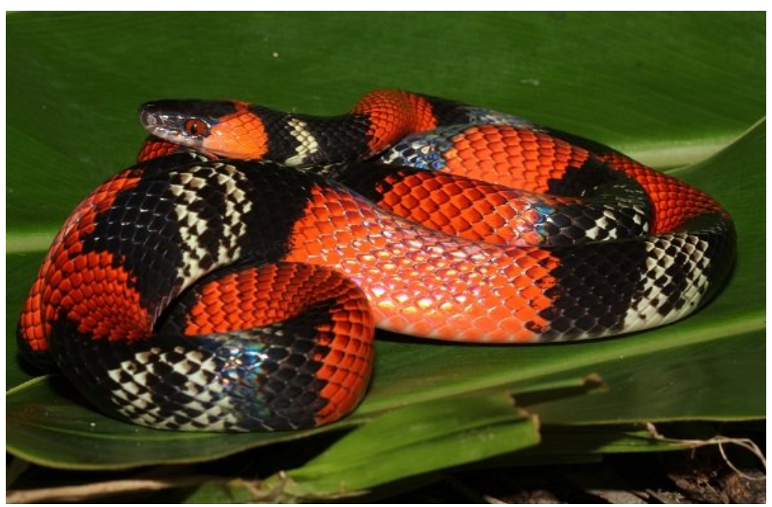
Figure 11: Adult specimen of Oxyrhopus guibei , Photo: Jaroslav Karhánek. Family: Dipsadidae

This species was found only once in transect number I at 21:30 PM. The area where it been found was between pasture/garden part and wetland area, crawling in grass on the ground from wetland where it was most probably on the hunt of frogs. It was an adult animal, female of total size 74 cm (Fig. 11).