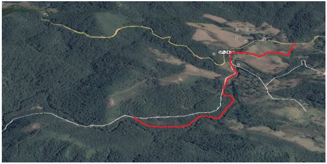
Figure 8: Bruno transect, scheme map.

extra re-cutting and was possible to move there because of lower amount of ground vegetation. Ground was covered by leaf litter. On the trees were in larger amount presented bromeliads, orchids and moss. Along road the vegetation was secondary forest and farm with several houses. Pasture/wetland area was large without any tree cover, only few shrubs and larger amount of water plants. Temperatures were during day very warm and high but at night was dropping down very rapidly. The area was visited in the very dry climate with no rain, it was very clearly visible in the forest which was very dry especially in our transect part.