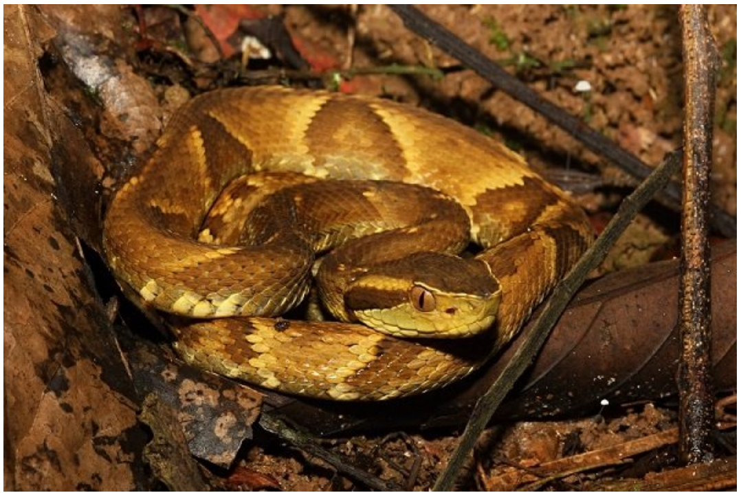
Figure 10: Sub-adult specimen of Bothrops jararaca , Photo: Jaroslav Karhánek. <u>Family:</u> Viperidae

During our research it was the most abundant species of snakes in most of the