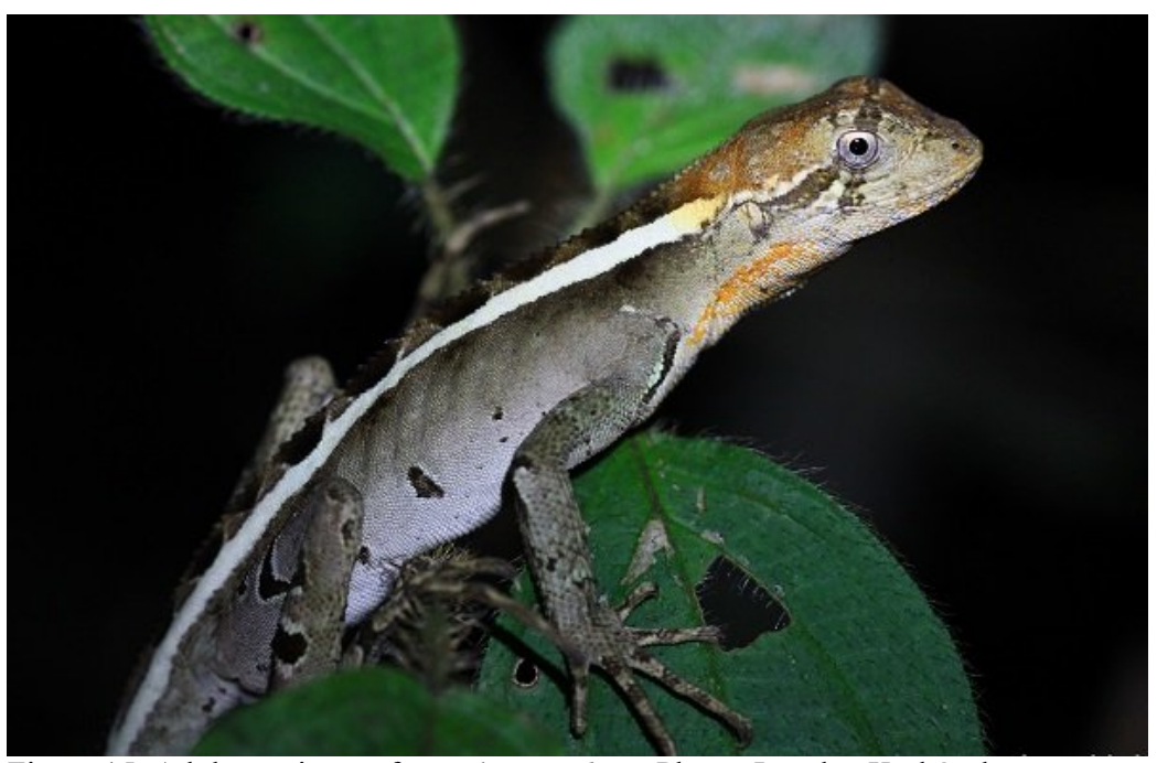
Figure 15: Adult specimen of Enyalius perditus , Photo: Jaroslav Karhánek. Family: Leoisauridae

The most abundant lizard species in the forested area in every elevation where research was done. In total it was found 21 individuals, 12 males and 9 females (Fig.15) from which were 6 juveniles or sub-adults. They were found on transects number II, III and IV. Maximum length of SVL was 8.2 cm and tail length 18 cm. All of them were found on the branches, logs, roots. During night they were found sleeping on the branches around 1.5 m above ground even during heavy rainfall. During day was possible to observe them only early in the morning. The coloration of individuals was variable according to the sex and age of the animals and day time.