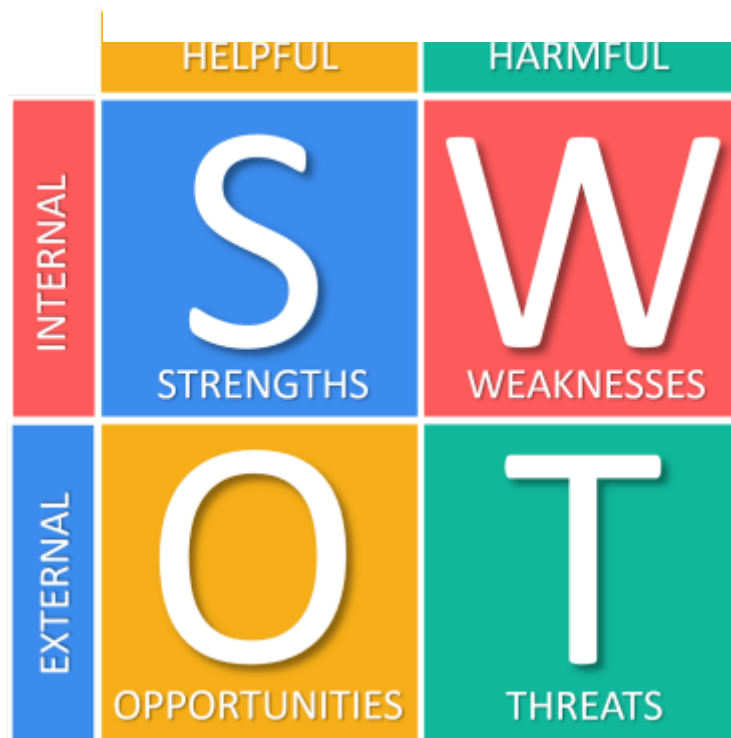
Figure 2, SWOT Analysis

The acronym SWOT, which is made up of the four terms Strengths, Weaknesses, Opportunities, and Threats, must first be appreciated by the author. A marketing examination of a company's internal and external factors called a SWOT analysis is used for strategic planning. Any goods, services, businesses, or even individuals can serve as the analytical method's subjects. The technique also was employed in rivalry disputes. The most alluring offerings for the target market might be determined from all those offered with the aid of SWOT analysis.