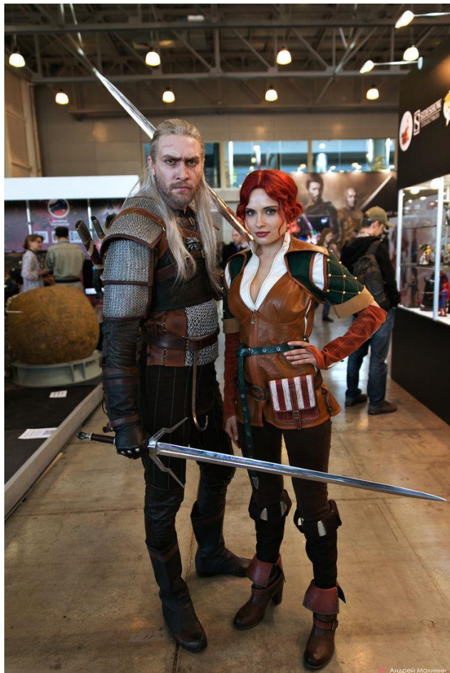
Figure 4 - Cosplayers presenting Geralt and Triss ([Agcooper73])