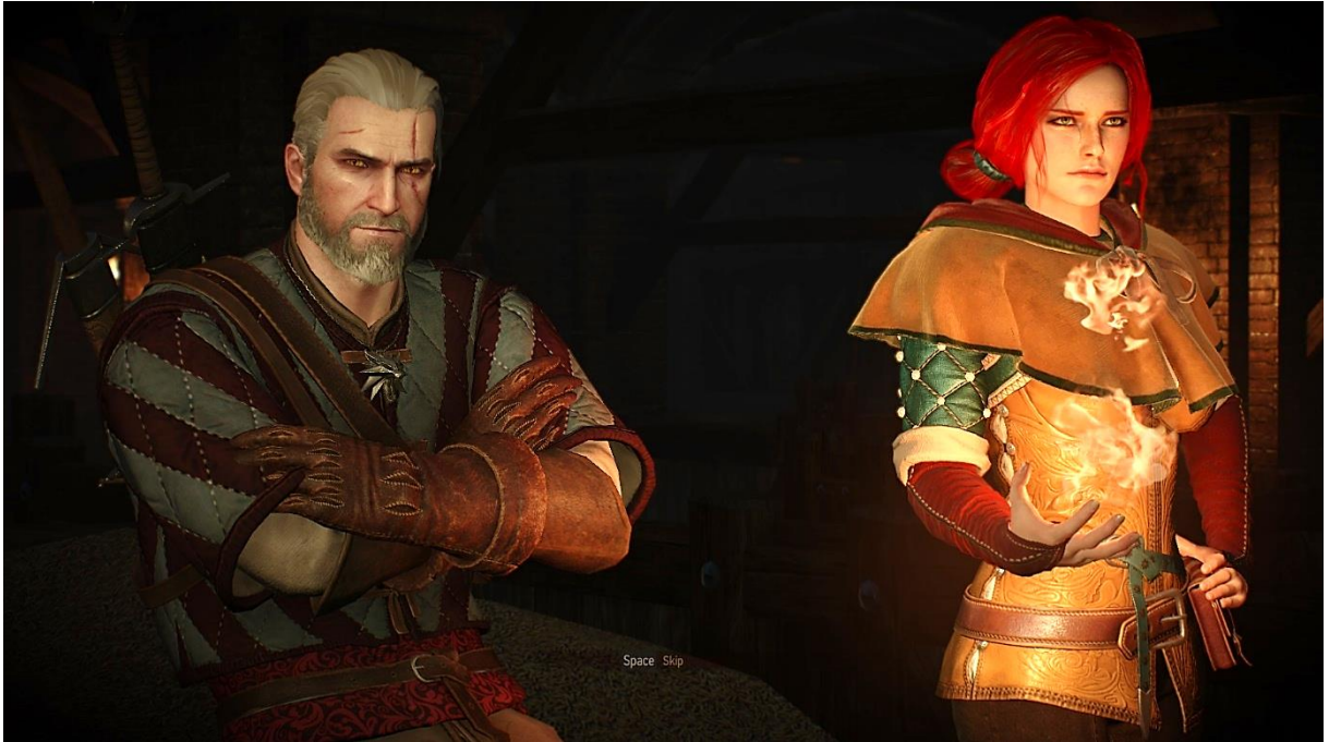
Figure 5 - Geralt of Rivia and Triss Merigold (in-game footage) (CD Projekt)