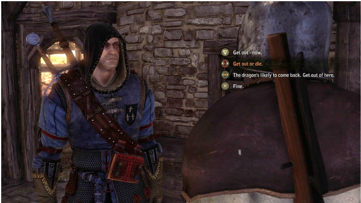
Figure 2 - A decision-making example (CD Projekt)