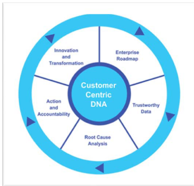
Figure 2: Net Promoter Operating Model