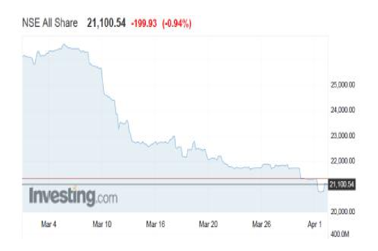
Figure 1: All-Share Index – Nigerian Stock Exchange