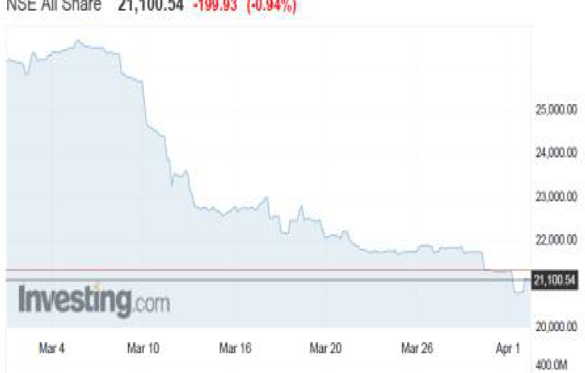
Figure 1: All-Share Index - Nigerian Stock Exchange