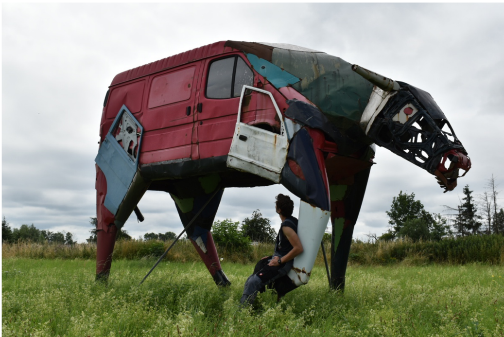
Figure 12. The author

Today, for the first time, it occurred to me that I have reached saturation.