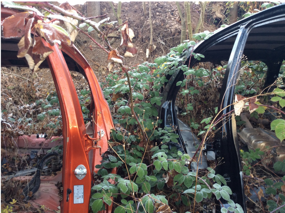
Figure 9. The yard's "entropy."

The auto salvage yard where I worked and conducted my research was divided into clear sectors; each of them had huge or small containers that functioned as intermediate stopovers for the trajectories of flowing waste. The order imposed on the yard fought against a persistent natural entropy. At some points entropy nevertheless dominated—since everything was always in the process of changing into something else (Ingold, 2011, p. 3; Reno, 2016, p. 9)—and one could see a slightly different world, such as the forgotten heavy metal beams being absorbed by tree trunks and shrubs, or life emerging inside the metal skeletons of the oldest cars: nests of slow-worms ( slepýš ), which are endangered and are thus a protected species in the Czech Republic.