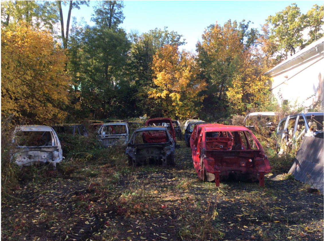
Figure 7. Car bodies waiting for their time to be reused.

Late on a sunny morning in September 2019, just before lunch break, Pan Vedoucí left the yard. Hynek and I decided to use this rare moment without anyone checking up on us to chill, chat, and stroll the yard. We spent a significant part of the time throwing stones at an old car window. While still chatting, we stopped at a car that seemed untouched by us, the salvage yard workers, yet had been placed among the metal