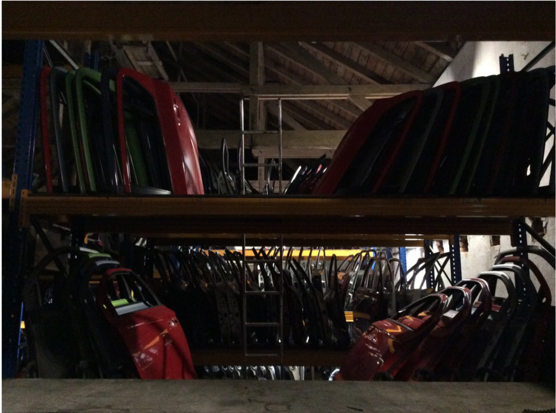
Figure 1. Former sugar factory storage house, nowadays serving for storing car body parts.

The yard was bounded and separated from the road by two of the aforementioned brick buildings on the western side and by a beautiful old wooden warehouse on the northern side. Behind that wooden warehouse—which smelled so nice, especially during summer, and reminded me of the smell of my grandparents’ old coal shed or old wooden railway sleepers—was a sawmill owned by another entrepreneur. At the eastern part of the yard, on a hill, there was a charming multi-storey building, the former sugar factory’s administrative building from the 1870s, which serves as an apartment building nowadays.