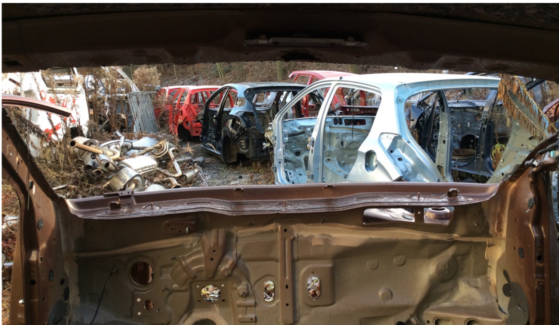
Figure 2. Processed car bodies hidden from the eyes of the yard's visitors.

Behind one of the brick warehouses was a space hidden from the view of the yard's visitors and, thus, contained processed car bodies waiting for their second life, all with their VIN (Vehicle Identification Number) codes removed. They were placed there to hide the yard's informal activity, that is, disposal of totaled cars, which was, in fact, illegal at that place. Next to these car bodies, one could find plastic containers for municipal waste containing all kinds of valueless stuff from the dismantling of the cars. There, unlike in the yard's visible part, chaos ruled, and that place was anything but tidy. No customer could visit the inside of the warehouses, as there were also traces of illegal activity, and probably none of them would realize that there were car parts worth millions of Czech crowns being stored.