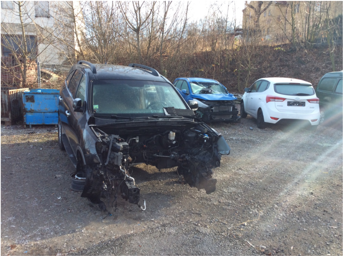
Figure 11. The IX55 missing its heart.

“Sixty-two thousand?” asked the stockier of the two men in a strong Eastern European accent.