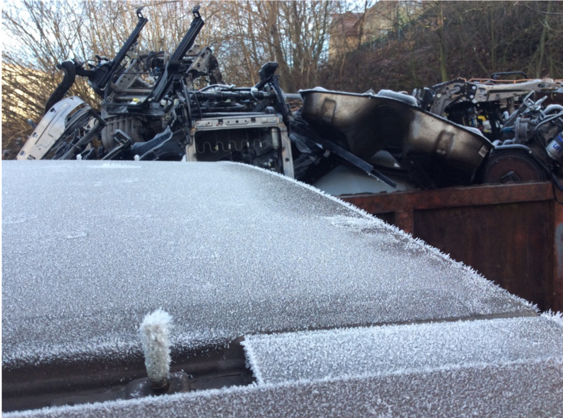
Figure 8. A freezing morning in the yard.

It was a sunny but cold morning in November 2019, and all the car bodies in the yard were covered with lace blankets knitted from frost. The naked, processed cars ready to be taken to a metal scrapyards looked like crafted goods from the display of a crystal glass shop in the tourist areas of Prague’s Old Town, or like the excavated skeletons of future ancient beings. I was enjoying playing with my imagination while sipping coffee when Hynek’s voice yanked me back: “Are you still sleeping or what?”