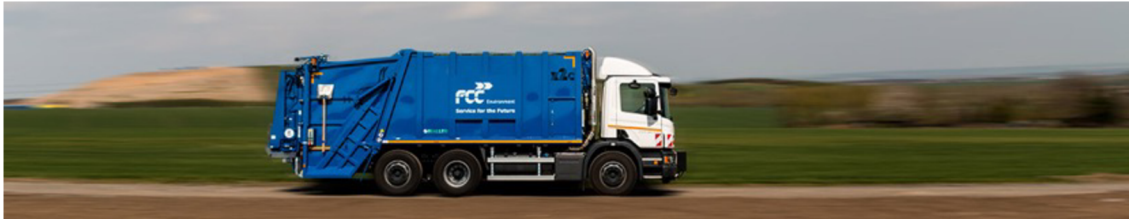
Figure 5. “FCC Environment: Service for the Future” garbage truck.

of waste generated during the dismantling of cars indicated that the three men in the vehicle were sanitation workers. As Alexander (2016) points out, the word waste disappears from public space. It is being replaced by various short text slogans, which in all cases contain the prefix “eco-“ or the words “future,” “recycling,” “sorting,” or “the environment,” as in the case of the blue truck.