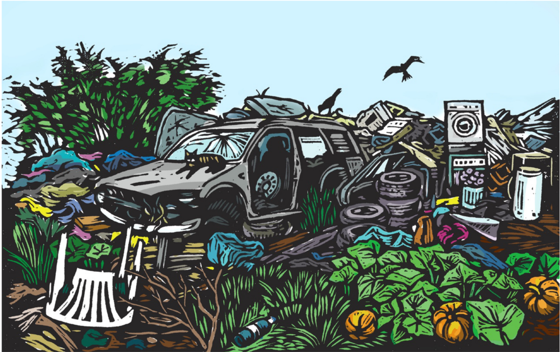
Figure 4. The yard as the Czech illustrator Dora Čančíková sees it. This illustration was originally made for our “Waste Regime at a Crossroad: Divergent Trajectories of Things, Cars, and Electronics” project ( www.wasteregime.cz ).