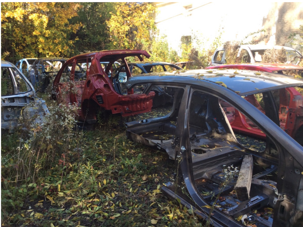
Figure 10. Car bodies missing their parts that were "glued" into another cars' bodies.