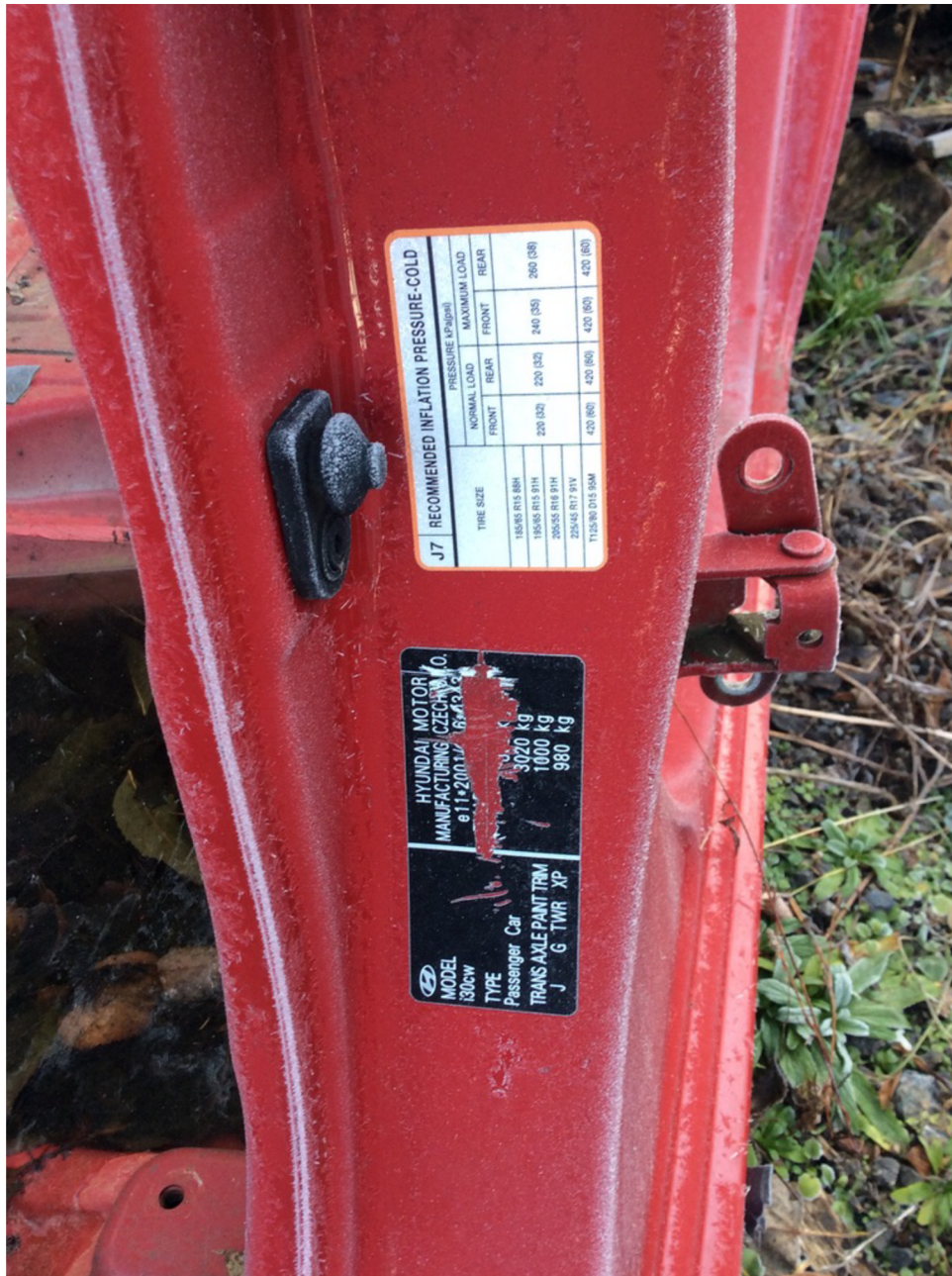
Figure 6. Removed VIN code.

aptly points out, “it’s an economy on wheels that reminds us that waste can be commodified” (Hawkins, 2005, p. 93).