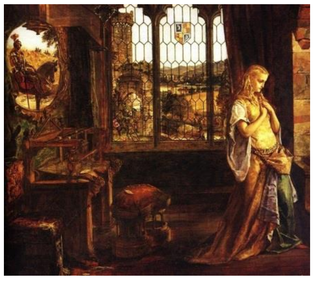
Appendix 3 William Maw Egley, The Lady of Shalott, 1858, oil on canvas 1858https://upload.wikimedia.org/wikipedia/commons/5/57/Shalott3.jpg, Accessed April 30, 2019.