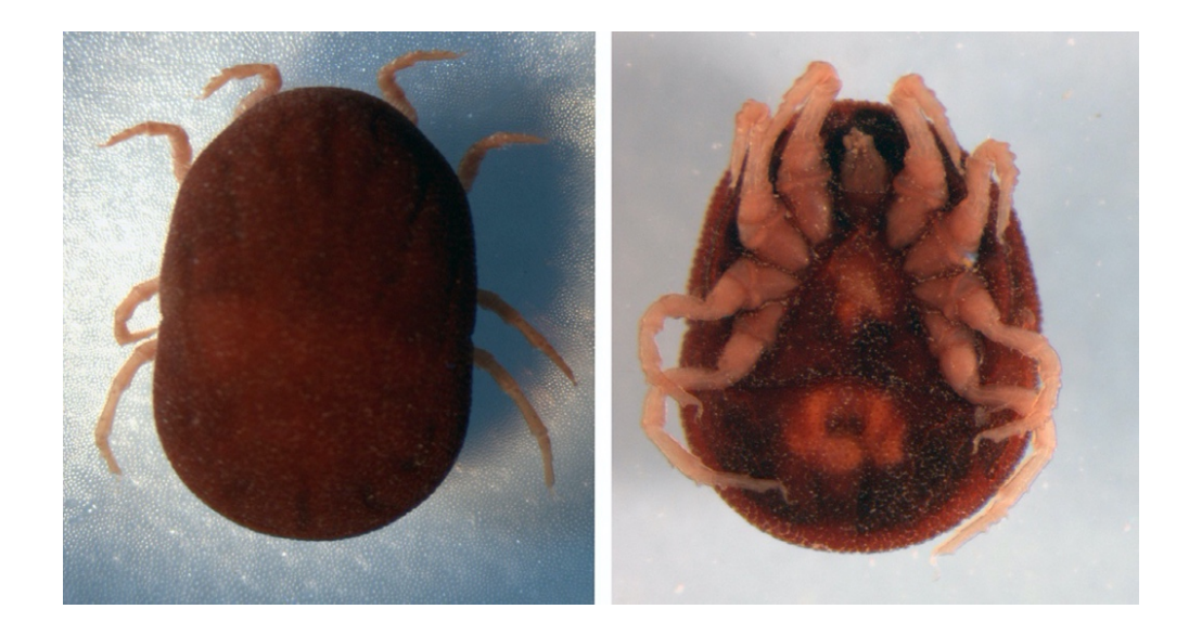
Figure 3. Ornithodorous moubata, adapted from [46]

[34, 35, 44]. Figure 3 shows a dorsal and a ventral view of O. moubata tick.