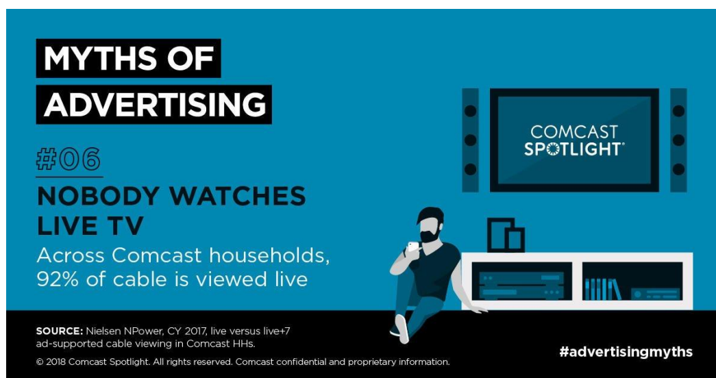
Figure 1.16 Myths of Advertising

In advertisements, the relation between text and visual aspects is sharp. It is possible to get the meaning only by reading a text with the same font and the same color. Still, the reader would seemingly need more time to process the message. Visuals help the recipient to reach the point even faster.