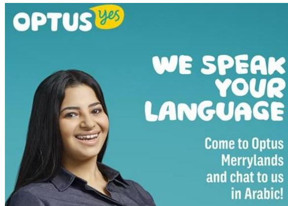
Figure 1.10 Optus advertisement

Another case could be employing a sentence fitting to multiple discourses. An Australian company called Optus did have a controversial advertisement featuring Arabic woman posing near text about speaking the language and being able to talk in the Arabic language (see Figure 1.10). The first sentence from an example above does contain possessive pronoun yours . According to B&T Magazine, the writer's motive behind using the pronoun was to state that the company has bi-lingual staff. Despite good intentions, people got an impression of pushing cultural boundaries and thus disliked the campaign. Unfortunately, the tensions between ISIS and the rest of the world are high, which makes the Arabic language a perfect "punching bag". To make the situation even worse, the mentioned language in the advertisement was creating more controversy. The point is, if a text has similarities with different discourse, it would be wise to specify clarifying information about the purpose.