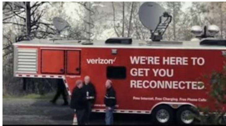
Figure 1.4 Verizon advertisement

A similar approach had the Verizon Wireless based in the United States.