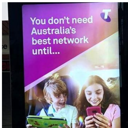
Figure 1.6 The upgraded payphones include large digital screens for advertising

The picture above is an advertisement (Figure 1.5) made by the Miami Ad School of Hamburg designed for Vodafone. In the advertisement, two types of discourses are present. The appearance of the slogan, technology and the name of the company is a demonstration of the typical discourse of advertisements. The presence of the text on the red background under a logo signals a deeper relationship with the service and the company. On the other hand, a text in speech bubbles depicts an uncomfortable message being sent between an unknown sender and recipient. The only indication that these two texts are related is present in the form of three dots. As a result of linking these texts together, the assumption of asking the recipient to mutilate the children is not that farfetched as it would seem. However, the assumption was intentional by the writer to present the theme of a malfunctioning network. Thankfully, the sentence under the logo reveals the network is just a fake model of a competitive telecommunication company.