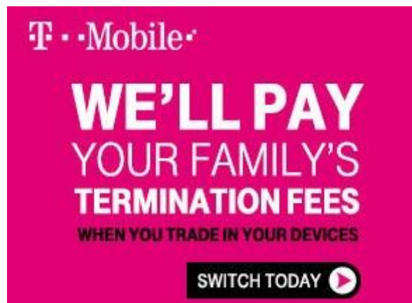
Figure 1.13 T-Mobile advertisement

Shomi was a Canadian video on demand service owned by Rogers Communications and Shawn Communications. The service ceased any operations in November 2016. This example (Figure 1.12) is a simple sentence on a purple background. The advertisement does not present any specific characteristics of the service or persuading any reader to use the service. The reader could detect two different sentences. First would be the name of the service and the second would be “the closing credits” due to being in different colors and shapes. However, the first letter of the definite article “the” is in lower case. If the reader says the whole text simultaneously, the pronunciation of the company’s name sounds similar to the phrase “Show me”. To this extent, the sentence could be read as “Show me the closing credits”. The intention behind used discourse is extraordinary. The possible explanation could be that the example is serving the purpose of saying goodbye to loyal customers.