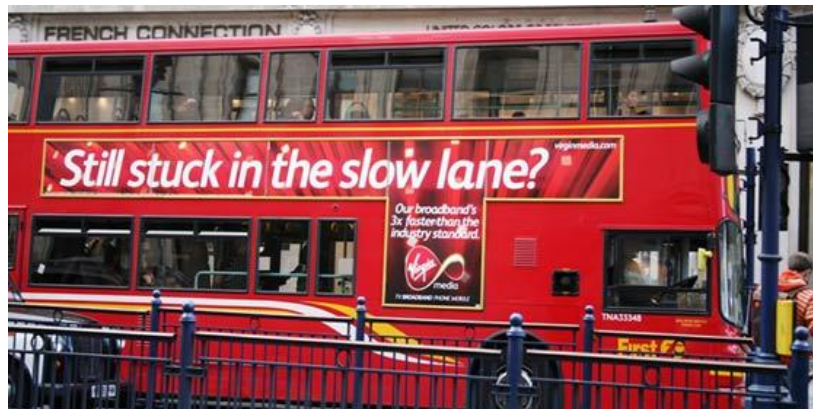
Figure 1.3 Virgin Media advertisement

The place, where the advertisement should appear, should be chosen carefully. One of the possibilities is advertisements on vehicles. The advertisement is mobile and can be seen in different parts.