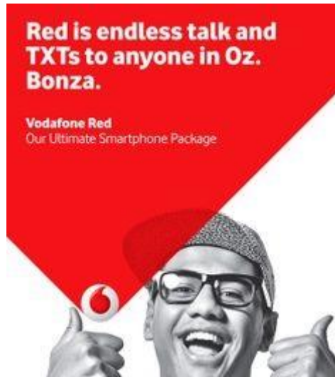
Figure 1.11 Vodafone Red advertisement

Another set of examples feature adverts from possible indoor locations around the world. These examples can be featured in printed media or on websites of the World Wide Web. The next example comes from an account of the supposed gallery website called Behance.