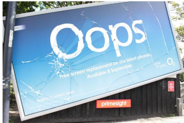
Figure 1.7 Oops

Up to this point, the main focus was targeted on characteristics of text itself; still, there are cases of a stronger relationship with the visual properties of an advertisement. The following example is an outdoor advertisement (Figure 1.7) of O2 Company from the United Kingdom.