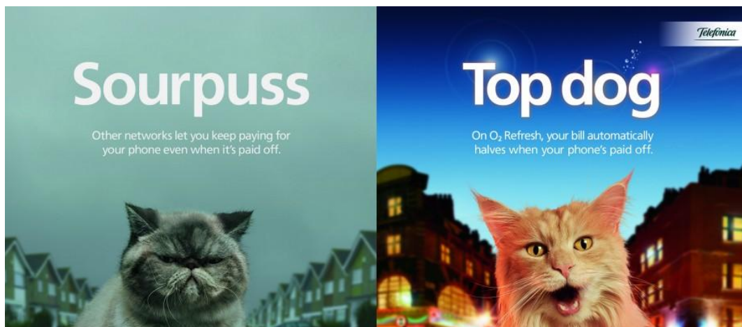
Figure 1.1 Sourpuss/Top dog

For the first example, the advertisement from a well-known company that operates worldwide will be analyzed.