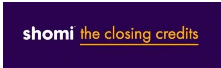
Figure 1.12 Shomi advertisement

Shomi was a Canadian video on demand service owned by Rogers Communications and Shawn Communications. The service ceased any operations in November 2016. This example (Figure 1.12) is a simple sentence on a purple background. The advertisement does not present any specific characteristics of the service or persuading any reader to use the service. The reader could detect two different sentences. First would be the name of the service and the second would be “the closing credits” due to being in different colors and shapes. However, the first letter of the definite article “the” is in lower case. If the reader says the whole text simultaneously, the pronunciation of the company’s name sounds similar to the phrase “Show me”. To this extent, the sentence could be read as “Show me the closing credits”. The intention behind used discourse is extraordinary. The possible explanation could be that the example is serving the purpose of saying goodbye to loyal customers.