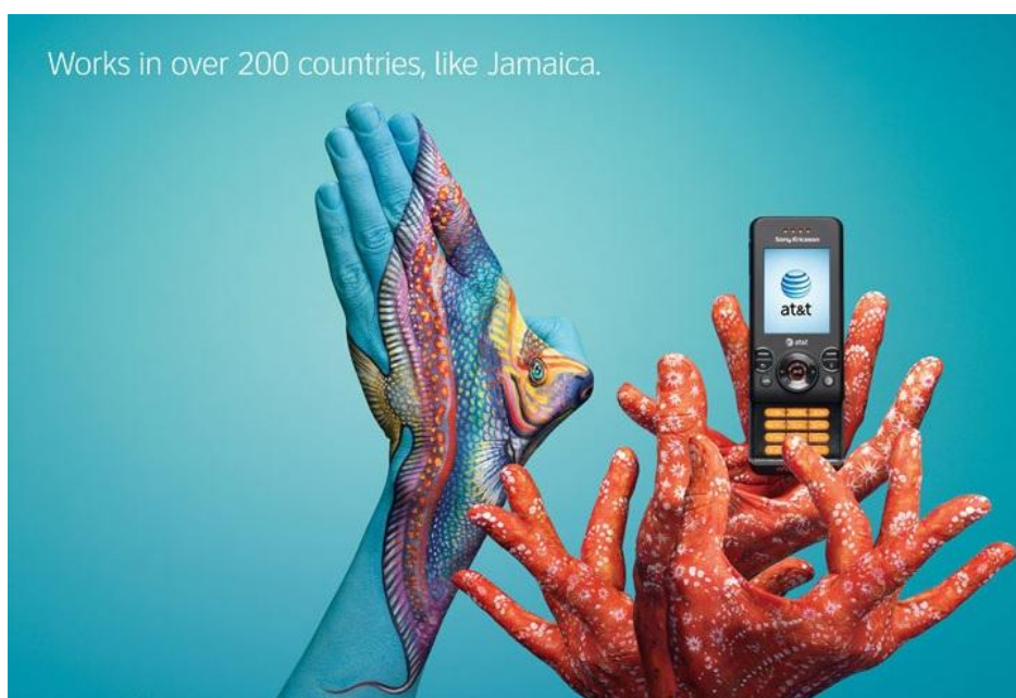
Figure 1.9 AT&T Jamaica

A pair of pink fluffy slippers appears in the hand of a woman in black clothes with annoyed expression in her face. A sentence next to her advice the audience to quit presenting products that would not be wanted by the customers. The advertisement aims to sell ad space to advertisers. Still, if the image was not shown, the message will probably be delivered to recipients as intended, as long as the logo or name is shown. The recipient would figure out the message by analyzing specific words in the sentence, such as “showing”, “product” and “customer”. Again, the presupposition is necessary for proper examination of the advertisement.