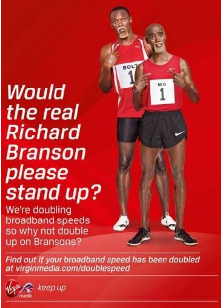
Figure 1.2 Please Stand Up

The intertextuality, which could be considered intentional, is presented in another example. Virgin Media Limited, a British company providing telecommunication services, released an advertisement featuring two famous athletes Usain Bolt and Mo Farah. Each athlete is pointing at themselves while standing near a text of the advertisement (Figure 1.2). The sentence in the largest fonts is copying a line from a rap song “The Real Slim Shady” by acclaimed rapper Marshall Bruce Mathers III, also known as Eminem, replacing the name “Slim Shady” with “Richard Brandson”, who is the owner of the corporation. The rapper is a well-known figure in the music industry and the song