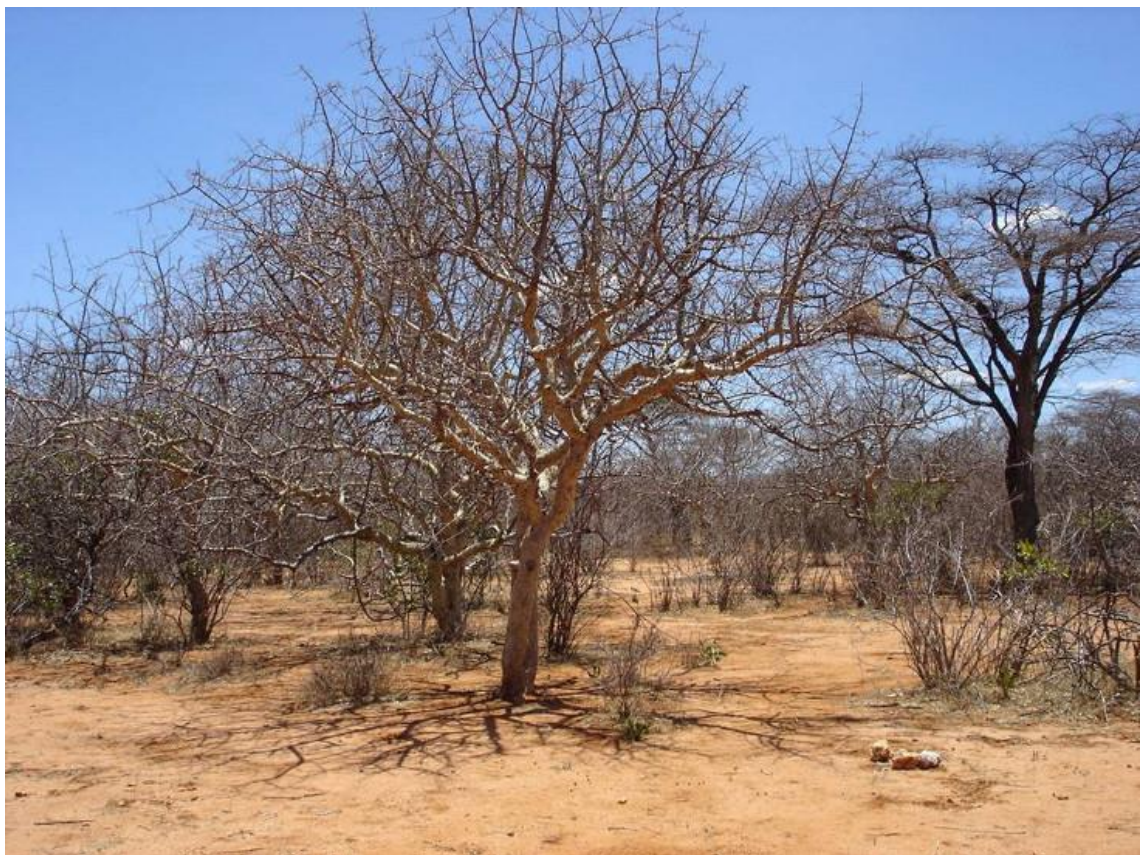
Figure 3: Somalia-Masai Acacia-Commiphora deciduous bushland and thicket (Bd). Gachathi F. 2011.

Canopy cover is less than 40 percent, so this vegetation is classified as bushland rather than wooded grasslands [28].