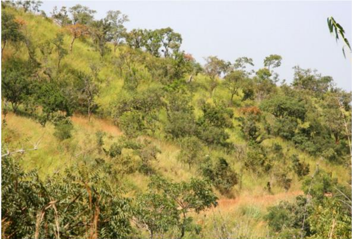
Figure 5: Combretum – Terminalia woodland and wooded grassland with tall underground of grasses (mainly Hyparrhenia species) on rocky outcrops east of Kurmuk (Ethiopia). Friis I, Demissew S. 1998.