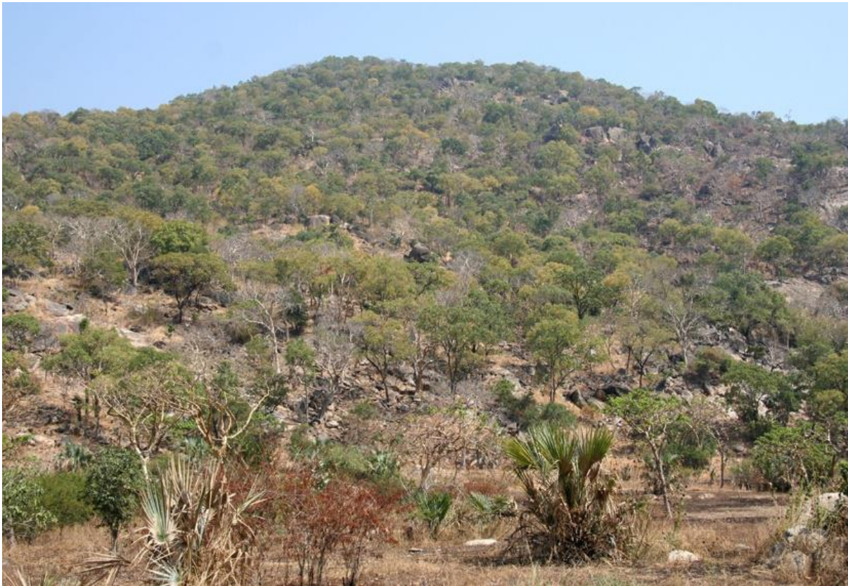
Figure 4: Combretum – Terminalia woodland and wooded grassland on stony soil derived from the basement complex at the foothills in Ethiopia. Friis I, Demissew S. 2008.

According to Trapnell and Langdale-Brown (1972) Combretum wooded grassland is East Africa's primary wooded grassland vegetation type. Predominant species in this vegetation type are broad-leaved Combretum and larger-leaved Terminalia . There were recorded two sub-types of Combretum wooded grassland, dry and moist Combretum wooded grasslands [28].