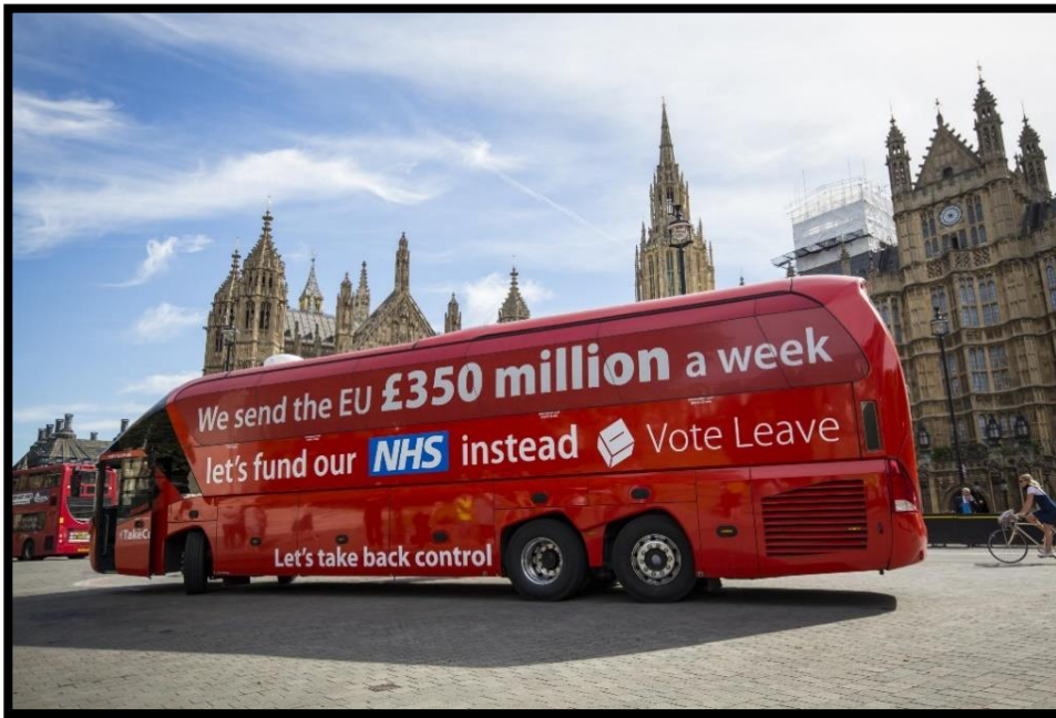
Figure 2 Brexit bus

4. Describe the image, what should it evoke in the reader?