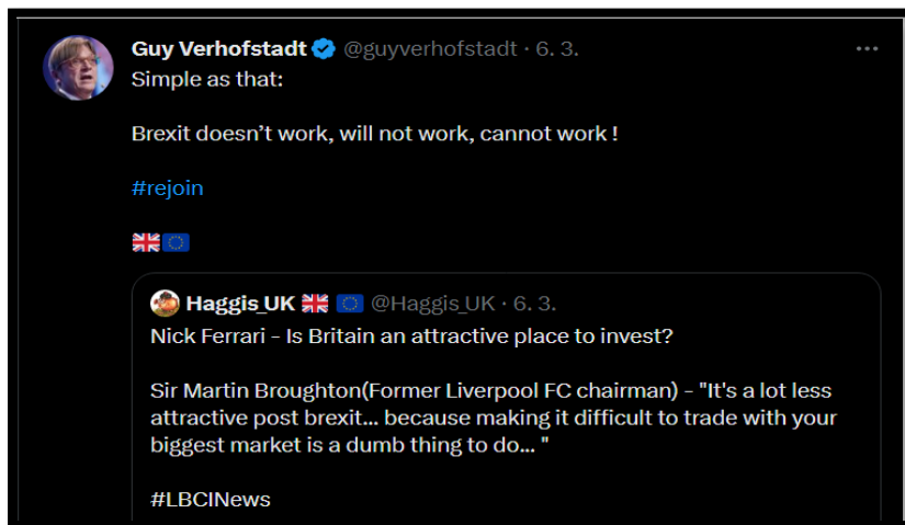
Figure 1-Twitter post by Guy Verhofstadt