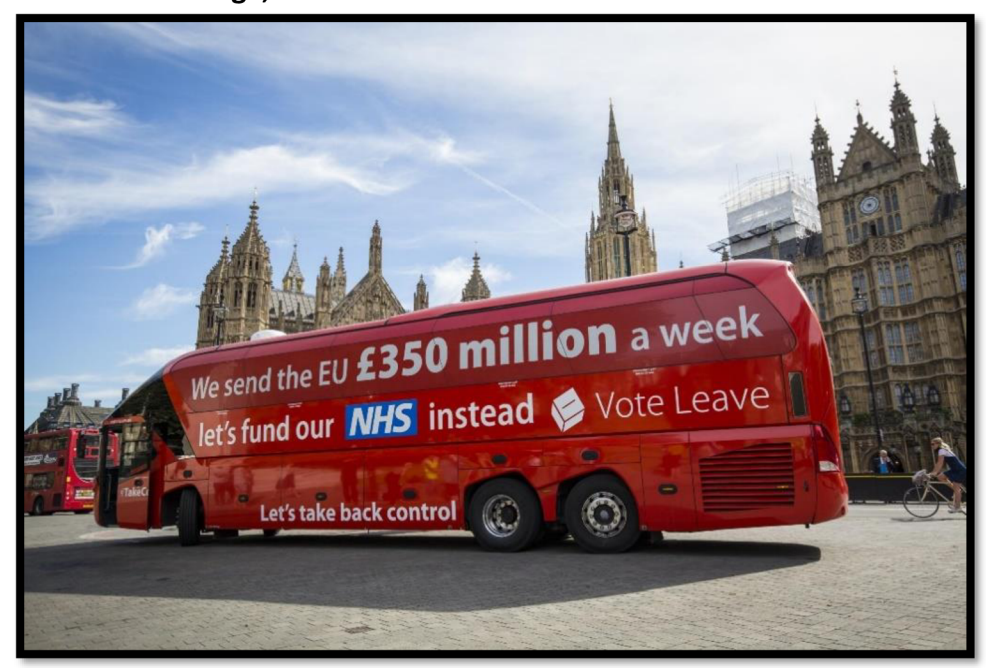
Figure 2 Brexit bus - The Independent

4. Describe the image, what should it evoke in the reader?