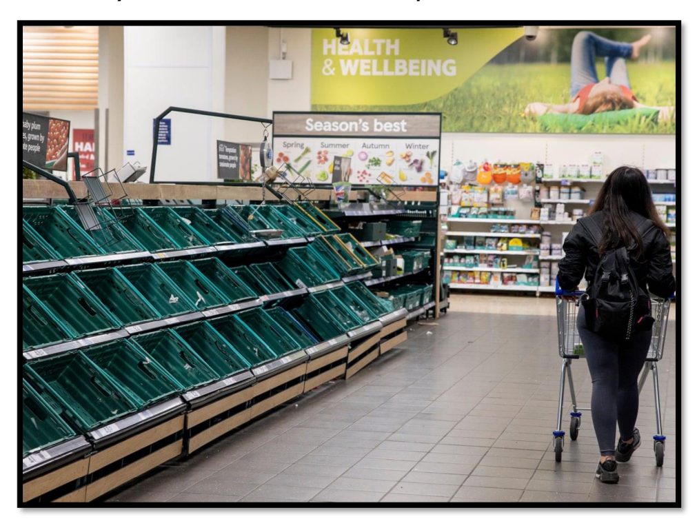
Figure 3 Empty shops after Brexit - The Guardian