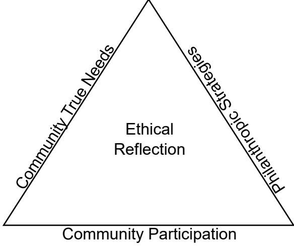
Figure 5.1 Ethical Philanthropy

The overview of the model is hereby presented, which the researcher refers to as "ethical philanthropy" and this is followed by its structural explanation and evaluation.