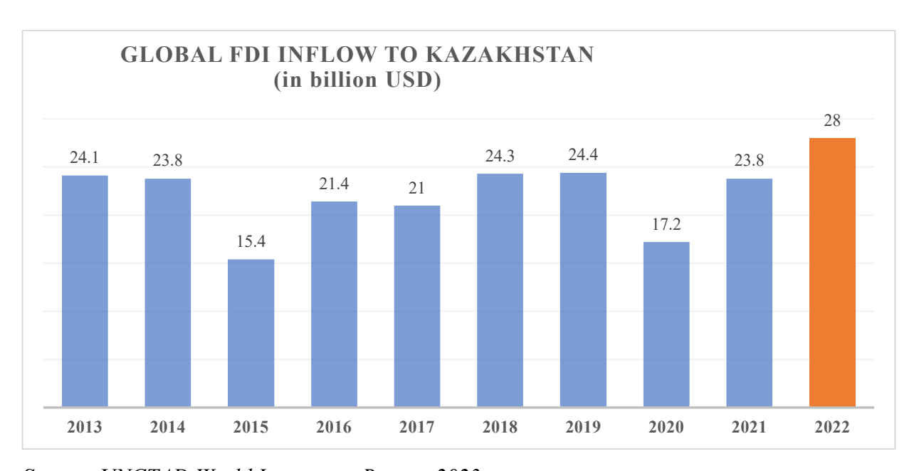
Figure 1: Global FDI inflow to Kazakhstan