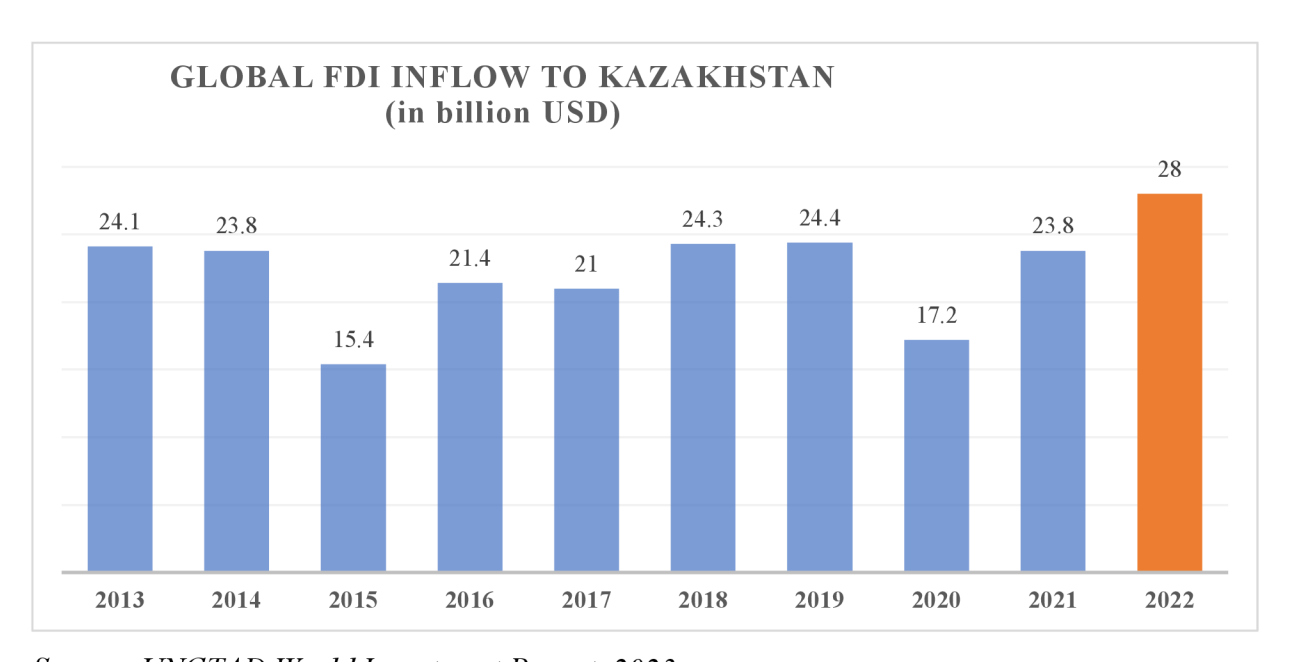
Figure 1: Global FDI inflow to Kazakhstan