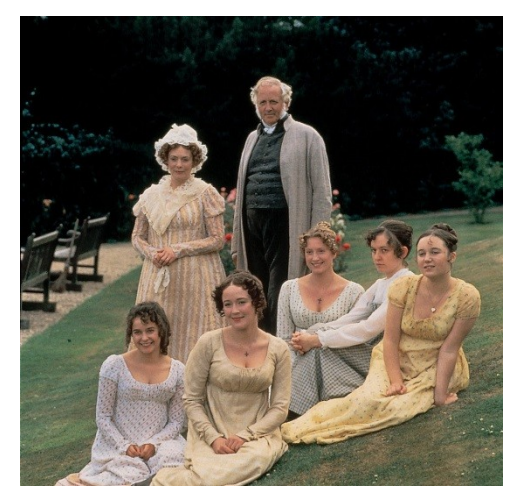
Figure 8TheBennet Family

Beside the main plot there are several other stories, which influence and develop the situations in lives of major characters.