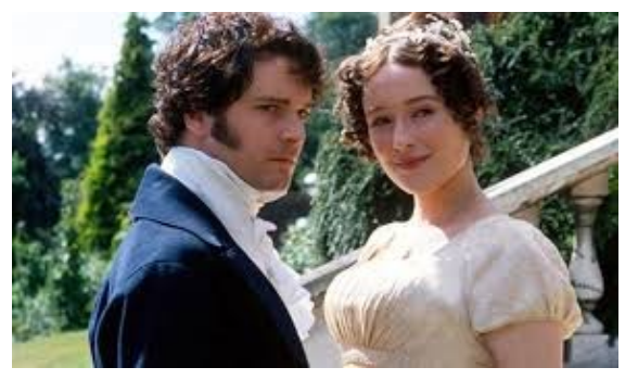
Figure 17 Elisabeth and Mr. Darcy

The plot of the story has a few more story lines.