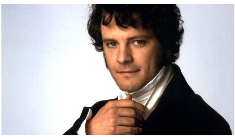
Figure 3 Colin Firth as Mr. Darcy

The personality of Mr. Darcy is shown in many contrasts. The first impression of his pride is soon displayed as the wrong one as his other valuable characteristics are revealed. He is a