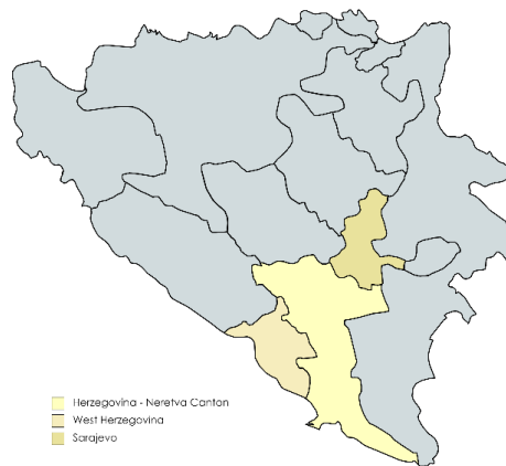
Figure 2: Site Area