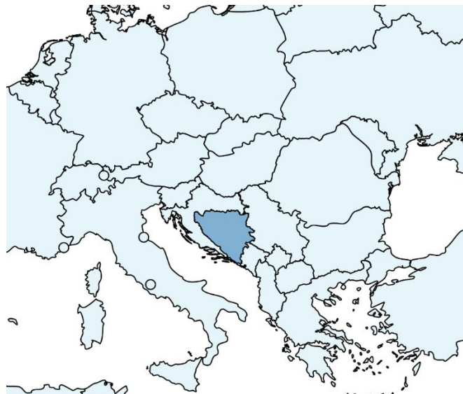
Figure 1: Bosnia and Herzegovina

Bosnia and Herzegovina (BiH) is a country in Southeast Europe, in the western Balkan region, surrounded by three neighbouring countries – the Republic of Croatia, the Republic of Serbia and the Republic of Montenegro. The political and administrative constitution of BiH is complex, and it is divided into three entities: the Federation of Bosnia and Herzegovina, Republika Srpska and Brčko District. (Matavulj, 2022). This complex political and governance structure also has a significant impact on management and capacity in the agricultural sector, which is influenced by different regulations at different levels with overlapping legislation and limited capacities and communication channels, as well as a lack of clear vision (Zurovec et al., 2015).