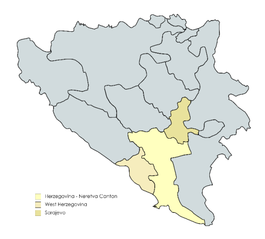
Figure 2: Site Area