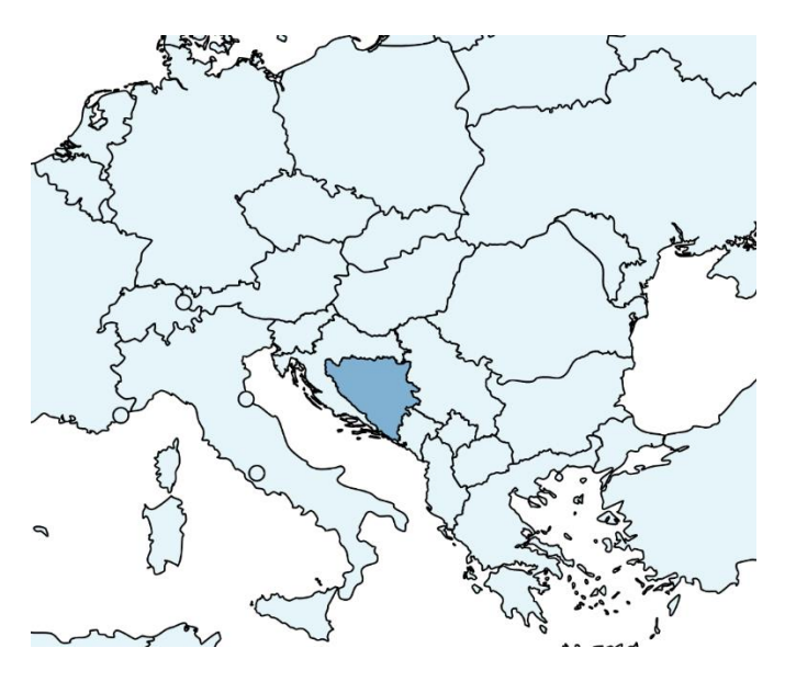
Figure 1: Bosnia and Herzegovina

Bosnia and Herzegovina (BiH) is a country in Southeast Europe, in the western Balkan region, surrounded by three neighbouring countries – the Republic of Croatia, the Republic of Serbia and the Republic of Montenegro. The political and administrative constitution of BiH is complex, and it is divided into three entities the Federation of Bosnia and Herzegovina, Respublika Srpska and Brčko District. (Matavulj, 2022). This complex political and governance structure also has a significant impact on management and capacity in the agricultural sector, which is influenced by different regulations at different levels with overlapping legislation and limited capacities and communication channel, as well as a lack of clear vision (Zurovec et al., 2015).