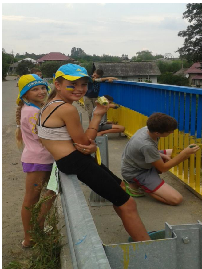
Picture 5 – Nizhny Stanivtsi 2014 – bridge being painted by local children to the colors of the Ukrainian flag

incident and the end was near. Trapped at the Maidan square the protestors formed a line and marched towards the parliament. The Ukrainian law enforcement started shooting resulting in almost a hundred dead. Keep in mind that the protestors were unarmed. On February 20 th the parliament under Yanukovych took a vote on reducing the brutality of the police with a positive result for the people of Ukraine and shortly after that Yanukovych fled the country. All of this was witnessed by hundreds of thousands of Ukrainians living abroad. Watching and holding their breath as people were dying for a life that the immigrants had often already had. The summer of 2014 was especially emotional for all of the participants as that is the time they would often return to their families. The same way I and my family did. I remember the summer feeling so hopeful. My grandma said a sentence that was stuck in my head for years after that: “The fight isn’t over, but we sure showed them what Ukrainians are made of.”. I did not fully understand what she meant by that at that time.