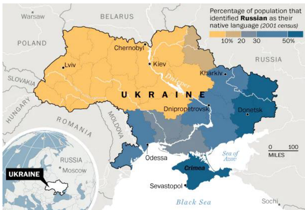
Picture 4 -Ukraine's language divide. Data source: 2001 national census. (Laris Karklis/Washington Post)

The map shows the clear division between Ukrainian and Russian speakers as the division between East and West. A division that is later used as a tool to start a war. This is the third attempt to define Ukrainian politics as pro-EU. The first spark of EU-directed politics was the independency in 1991 followed up by the Orange Revolution (2005) and Maidan Revolution was the third wave of Ukrainians voicing their opinion. January 17 th during the Euromaidan protests was marked by the call of public organizations for a last resistance, a last stand. The idea was simple. People would gather at the square of Independency in Kyiv. Two days later police riots would break up with the intent to stop the protestors from using police brutality. The conflict escalated to the point where protestors started making Molotov cocktails and throwing stones at the police. January 22 nd was the day that will live in the mind of Ukrainians forever. A police sniper shot dead two protestors Serhiy Nigoyan and Mykhailo Zhyznevskyi. This was a point of no turning back for the Ukrainians fighting for their freedom. There was no more talking or negotiating. There was only demanding and taking what they believed to be theirs. A month of chaos took hold of Ukraine after the sniper