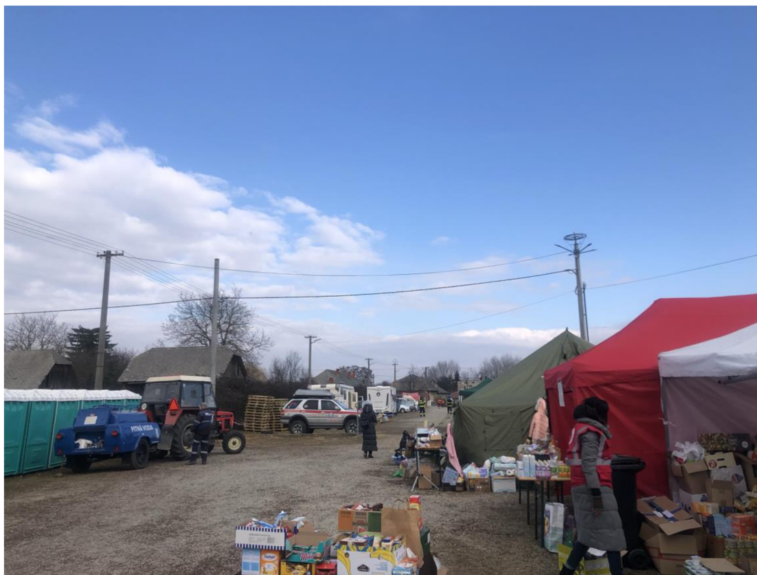
Picture 1 – Refugee camp - Velké Slemence February 2022

experiencing horrible events. A privilege people from outside will never fully understand and therefore might get agitated that someone simply doesn't care for their help.