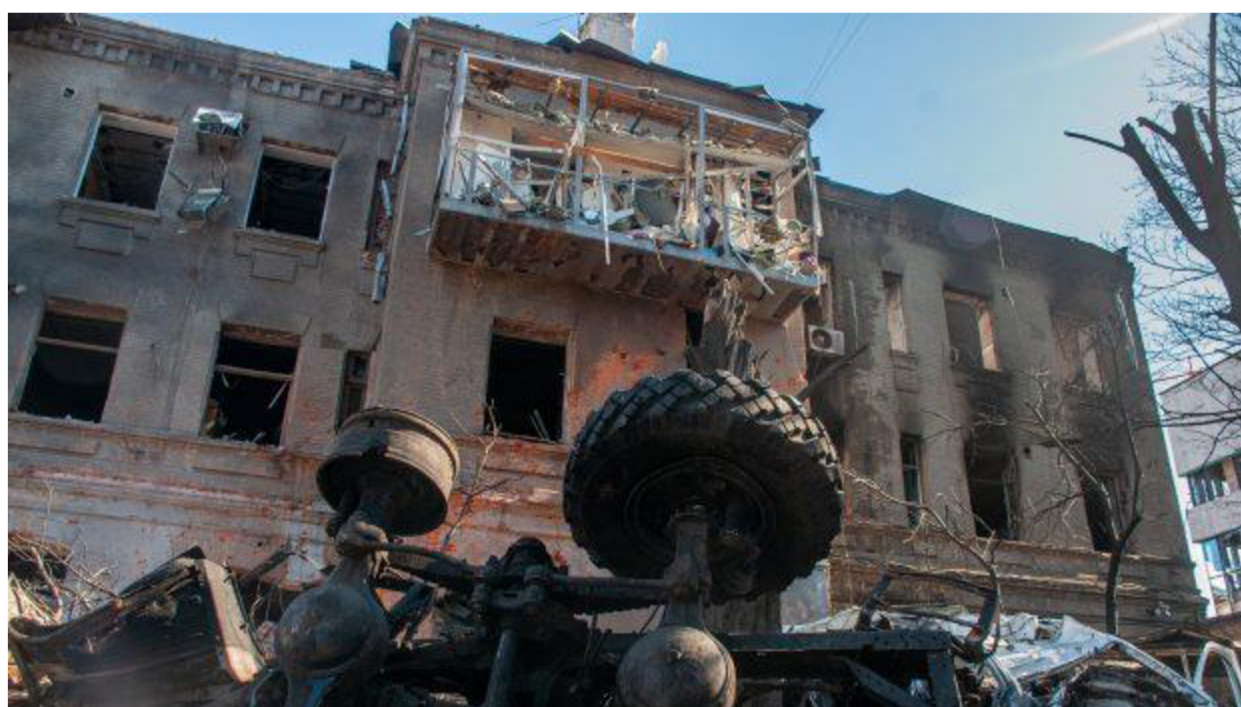
Picture 5 – Damaged city Cherson

'He lived in the basement and was afraid of every explosion.' A Ukrainian woman from Kherson met her five-year-old son after a month.